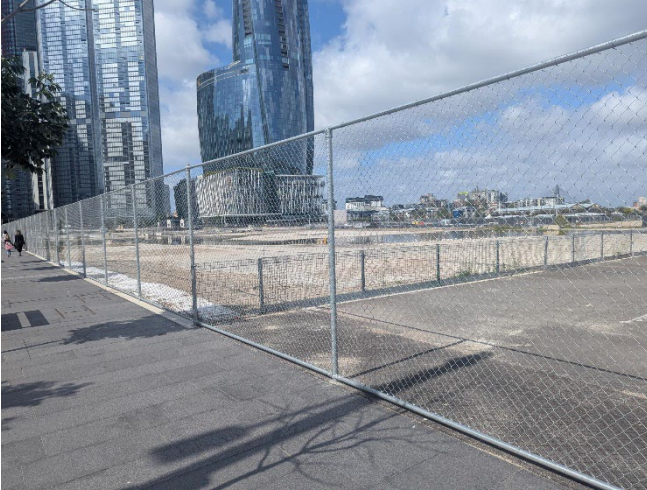
View into the Site from Hickson Road, looking south-west