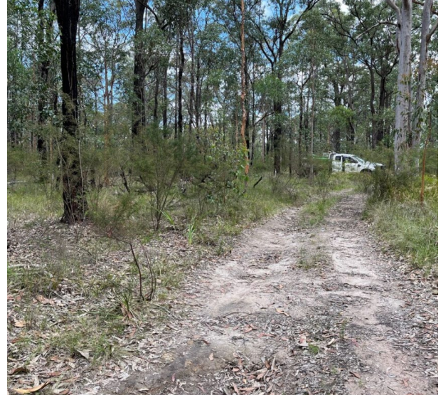
Figure 2: Proposed Office/Weighbridge/Workshop Location