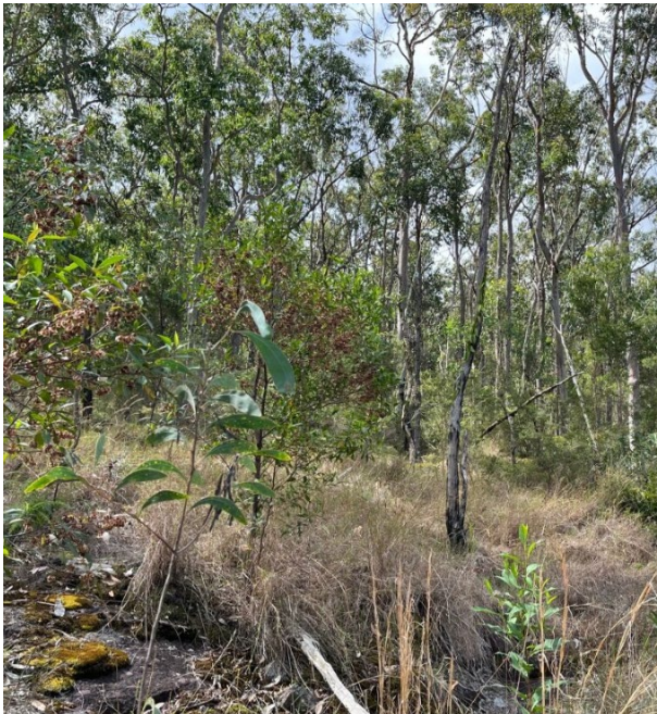
Figure 3: Resource Exposure