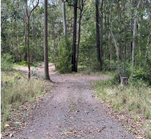
Figure 1: Site Access from Italia Road