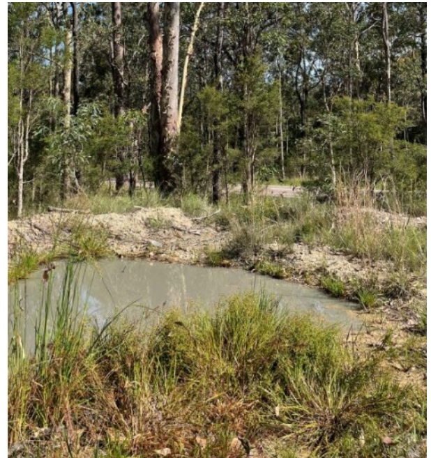
Figure 4: Alternate Site Access Point Considered by Applicant