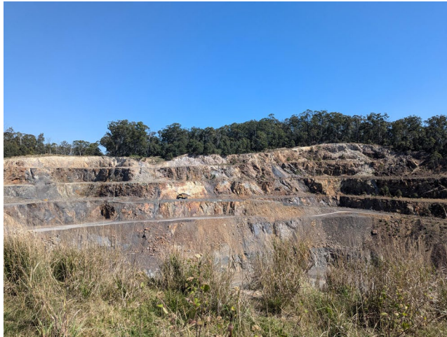
Figure 1 - Existing Extraction Area looking West