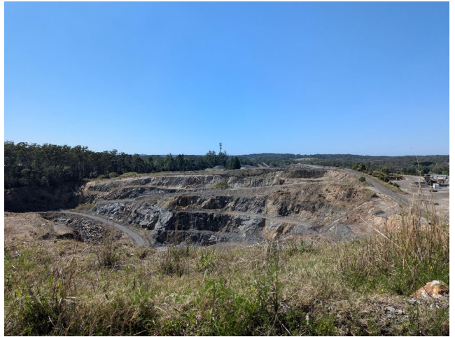
Figure 2 - Existing Extraction Area looking north-east