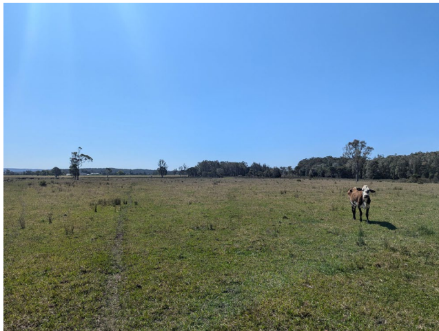
Figure 3 – Proposed revegetation area