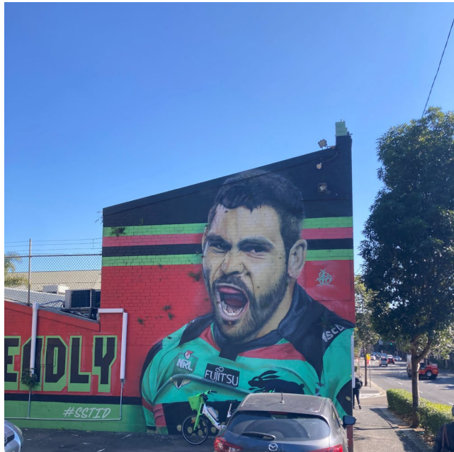
View of Greg Inglis mural on exterior wall of existing building on Site at 175 Cleveland Street