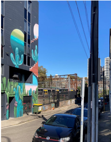
View of Woodburn St and adjacent rail corridor from intersection with Cleveland Street