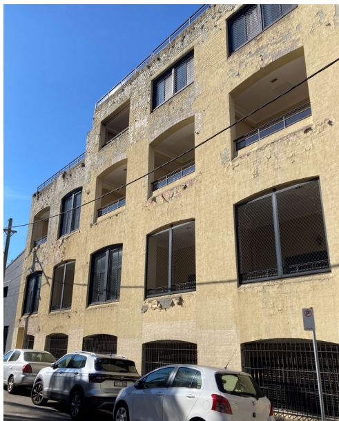
View of existing building on Site at 6-8 Woodburn Street