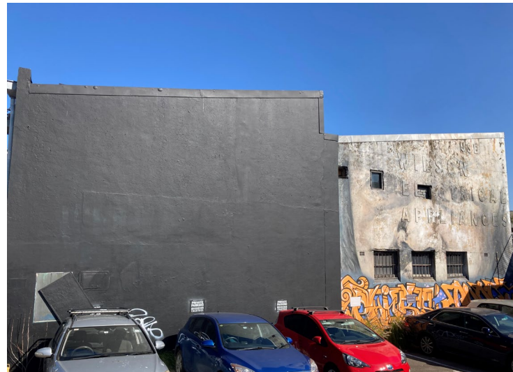
View of existing carpark at 177 Cleveland Street, with Stolen Generation girl mural at image right