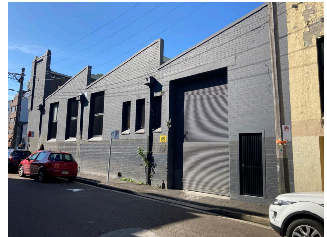
View of existing building on Site at 175 Cleveland Street