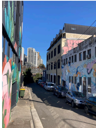
View of Woodburn St and existing buildings on Site at 1-5 Woodburn and 6-8 Woodburn Street (residential terraces at rear of image)