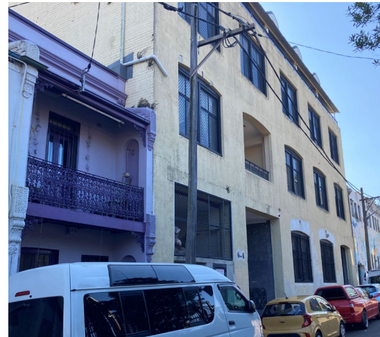
Interface between existing building on Site at 6-8 Woodburn Street and neighbouring terrace at 9 Woodburn Street