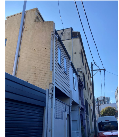
View towards neighbouring terraces at 9, 10 and 11 Woodburn Street