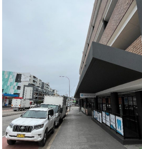
View along Pittwater Road and 2 Delmar Parade frontage, looking north