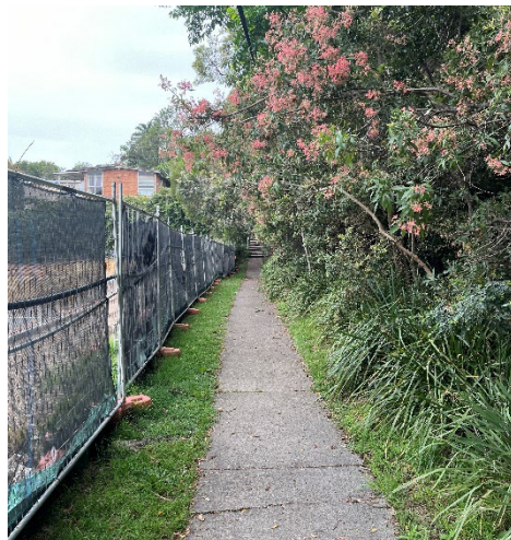
View to existing pedestrian path to Tango Avenue, Site at image left