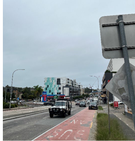
View along Pittwater Road, looking north (Site at image right)