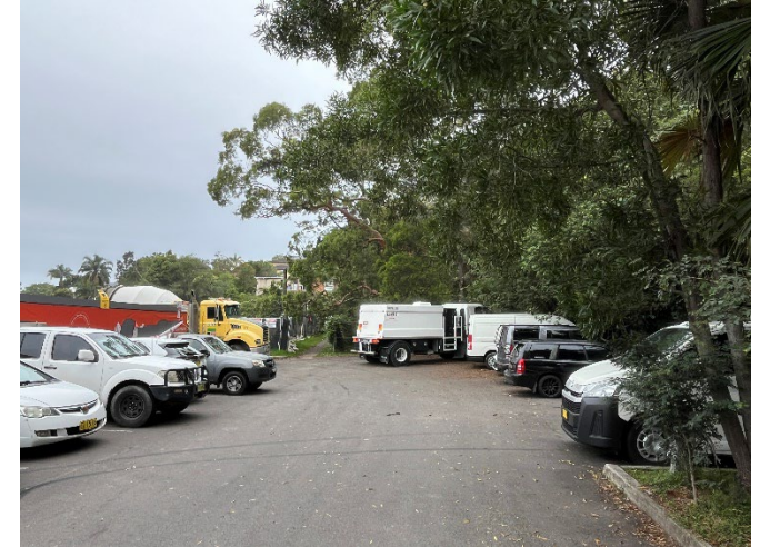
View to Stony Range Regional Botanical Garden Car Park, looking east