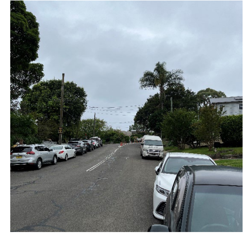
View along Delmar Parade, looking east