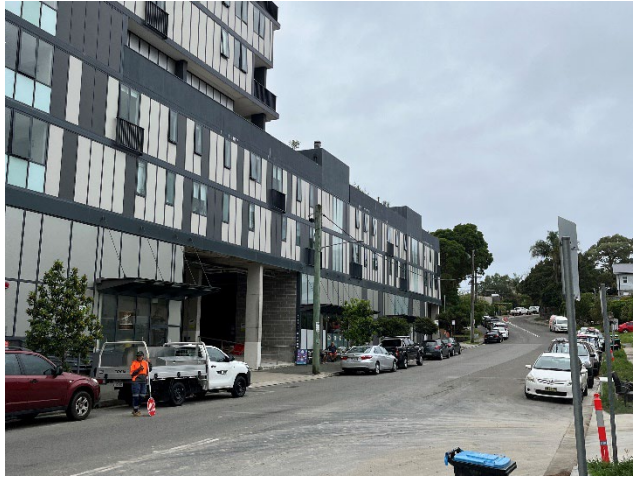
View along Delmar Parade with 822 Pittwater Road at image left, looking east