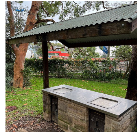
View to current picnic facilities, looking north (Site and car park in image background)