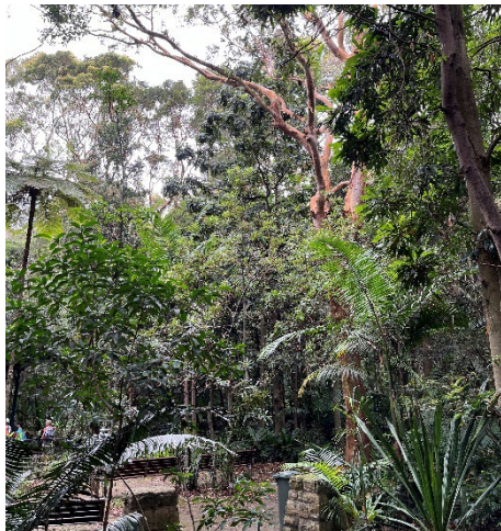
View within Stony Range Regional Botanical Garden