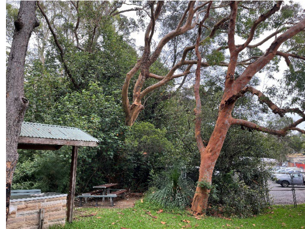
View to current picnic facilities, looking west (car park in image background)