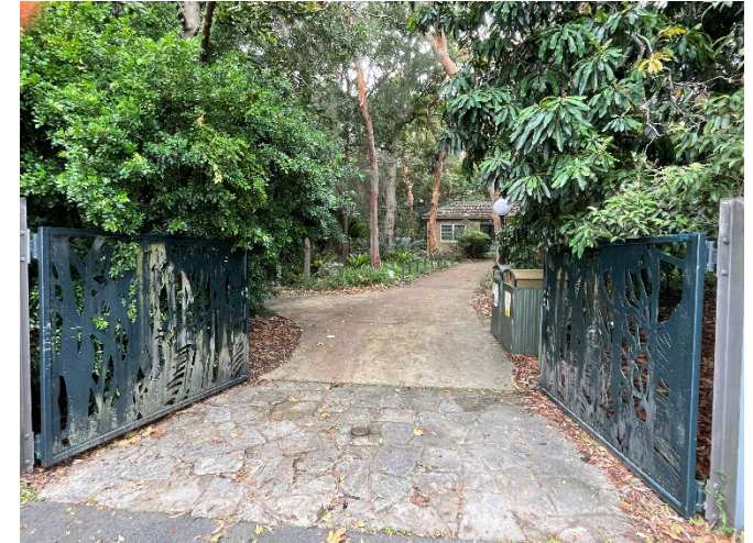
Entrance to Stony Range Regional Botanical Garden