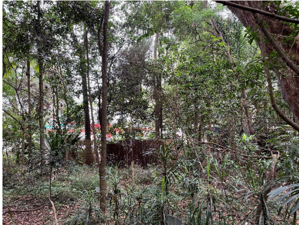
View within Stony Range Regional Botanical Garden