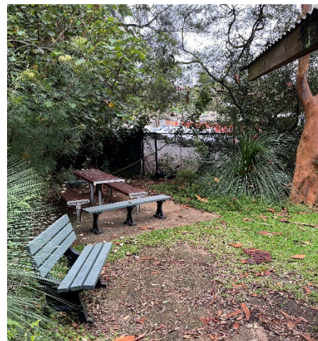
View to current picnic facilities, looking north-west (car park in image background)