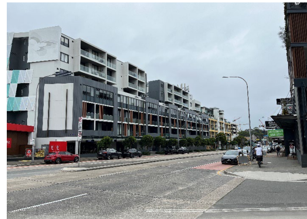
View towards Pittwater Road and Delmar Road intersection, looking north (627 Pittwater Road in image background)