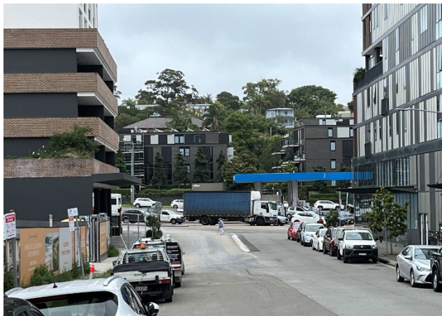
View towards Pittwater Road and Delmar Road intersection, looking west