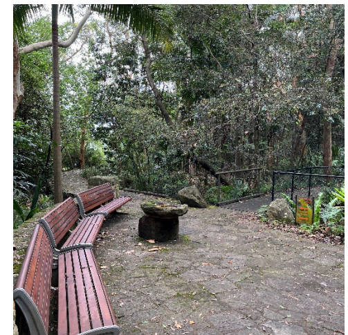
View to rest area within Stony Range Regional Botanical Garden