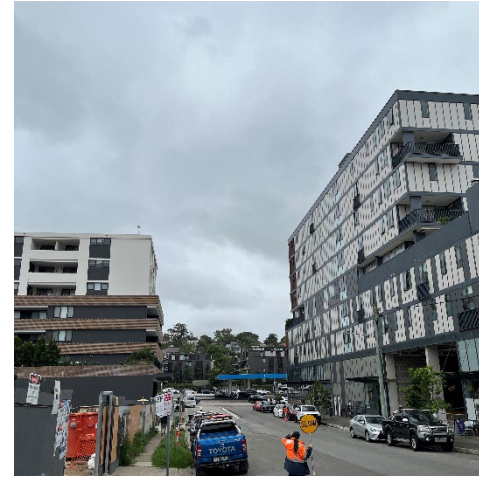
View along Delmar Parade towards Pittwater Road, looking west (2 Delmar Parade and Site at image left)