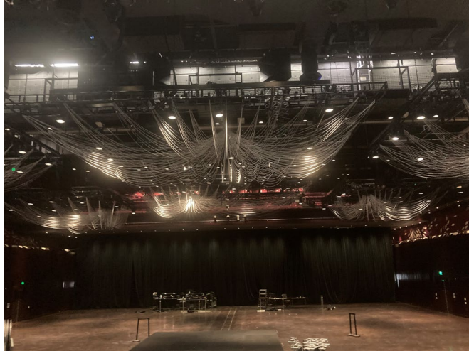
View towards back of existing theatre within MUEF.

The Panel additionally viewed the interior of the existing theatre within the MUEF and the existing link corridor. The Panel noted the approximate location of the proposed live room above, as well as the dimensions of both the existing theatre stage and the proposed fly tower above.