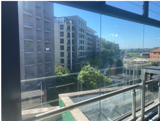
View towards Watermark Tower (image left) and other nearby residential buildings, looking north.