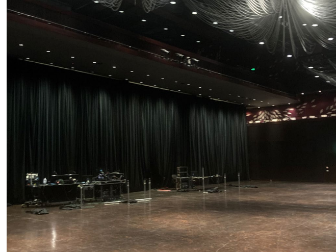
View towards back corner of existing theatre within MUEF, with proposed live room above.