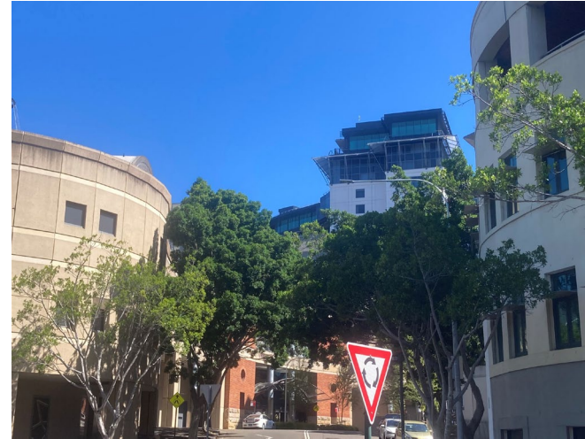
View of site (looking south-west), with the Star Grand Hotel in background.