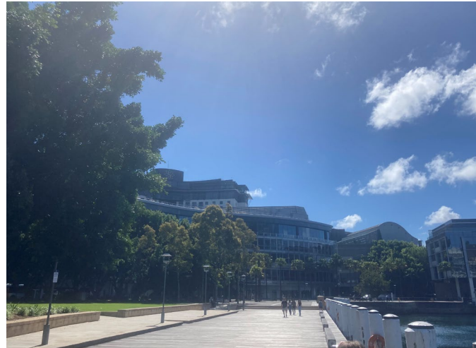
View of site (looking north-west) with proposed fly tower location roughly at image centre.

The Panel viewed the site from the south-east at Pymont Bay Park and Pymont Wharfs, and observed the location of the proposed fly tower.