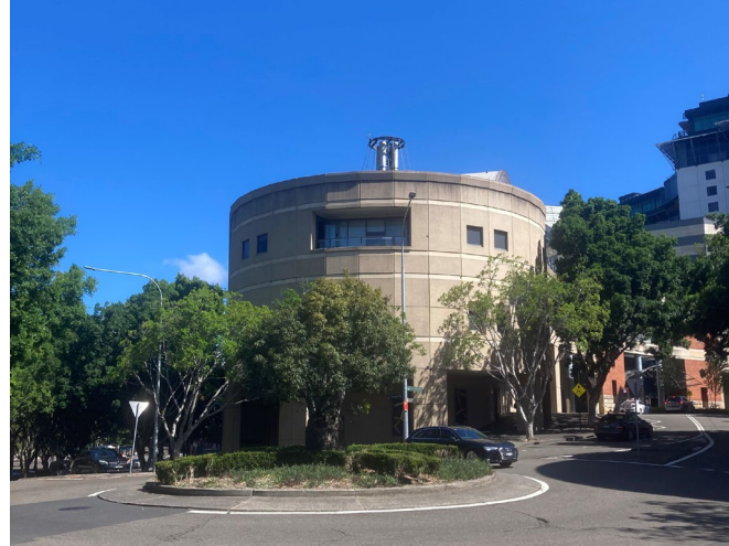
View of site (looking south), with proposed fly tower location roughly at image centre.

The Panel viewed the site from the north at the Pirrama Road/Jones Bay Road roundabout, and observed the location of the proposed fly tower.