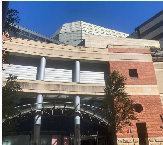
View of site (looking south-east), with MUEF (image-top) and entrance to the Star (image-bottom) visible.

The Panel discussed architectural changes to the existing building with the Applicant.