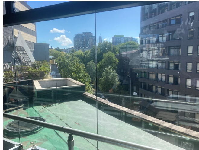
View towards Watermark Tower (image right) and other nearby residential buildings, looking south-west.