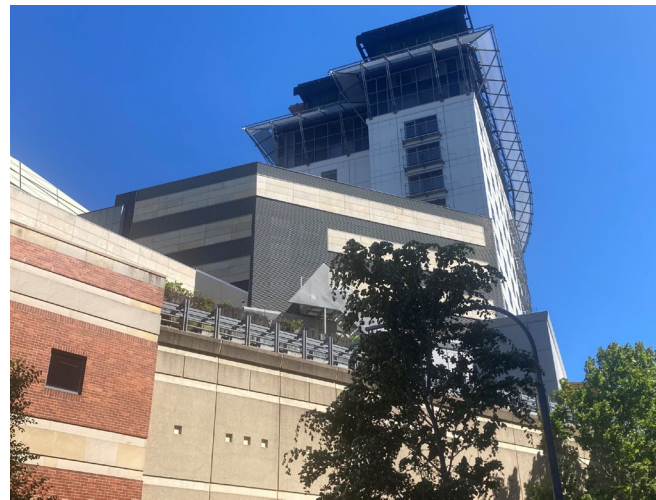
View of site (looking south), with the Star Grand Hotel in background.