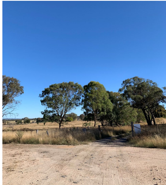
View from Gardiners Road, looking south towards Pounds Lane