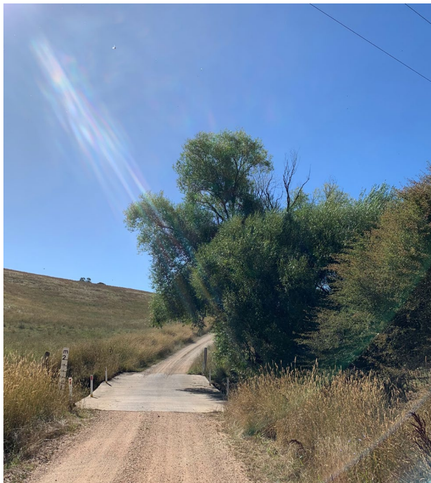
View from Dungeon Road, looking north-west