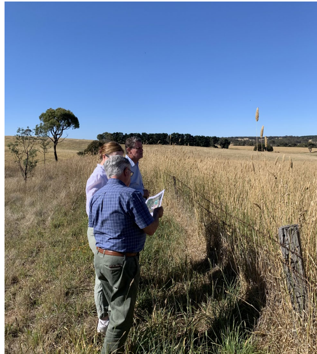
View from Dungeon Road, looking north