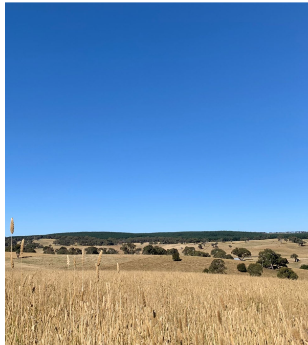
View from Dungeon Road, looking north-east