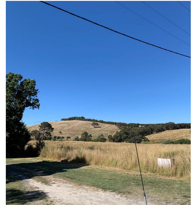
View from Walkom Road, looking north-east