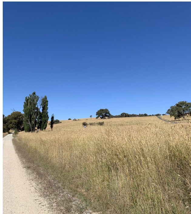
View from Dungeon Road, looking north-east