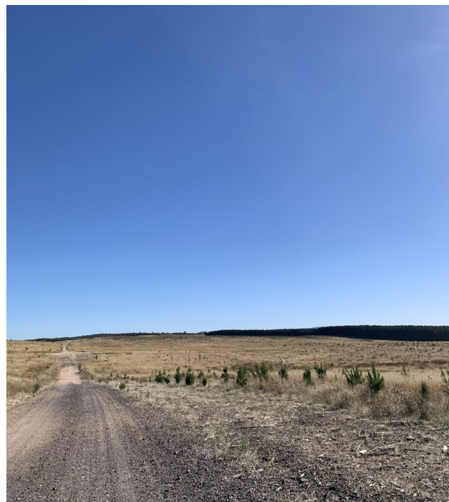
View from Gardiners Road, looking south including view of Vittoria State Forest