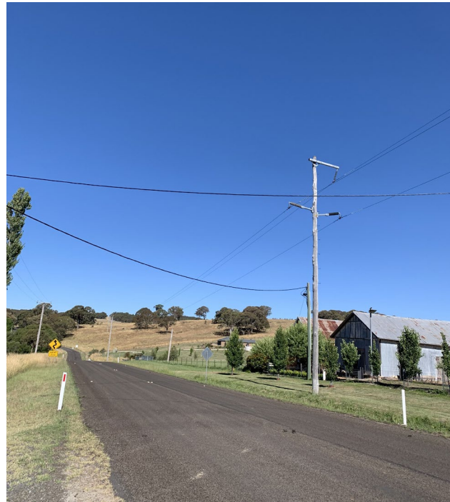
View from Walkom Road, looking east