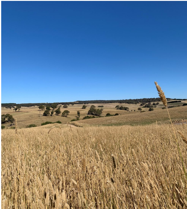
View from Dungeon Road, looking south-east