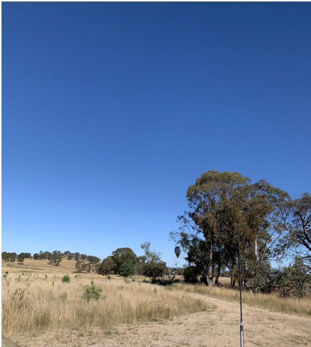
View from Gardiners Road, looking east