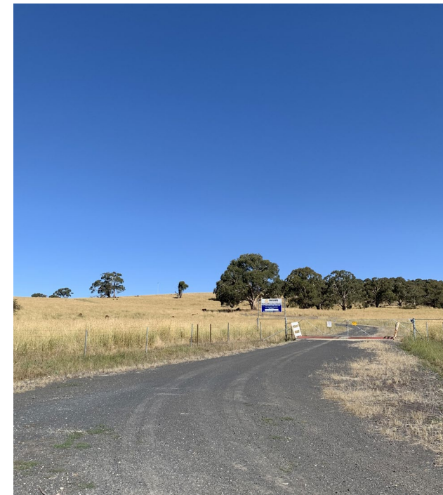
View from Dungeon Road, looking east towards the existing Site access