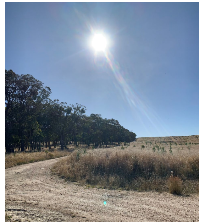
View from Gardiners Road, looking west