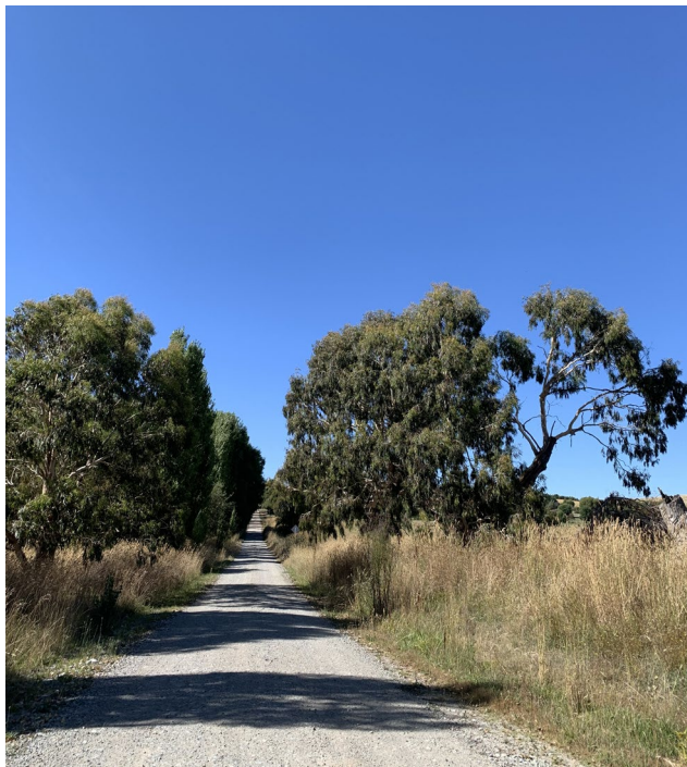
View from Dungeon Road, looking north