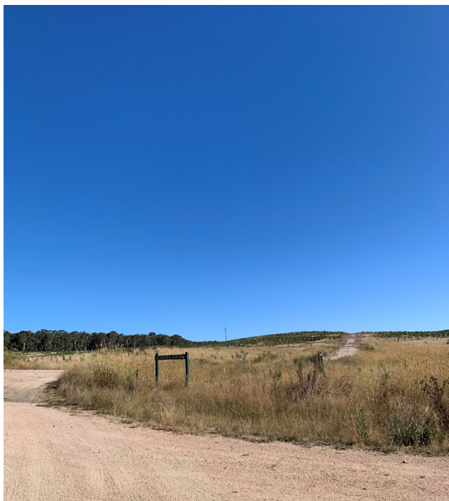
View from Gardiners Road, looking south