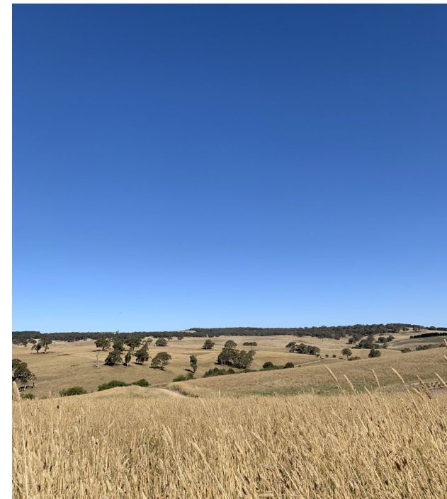
View from Dungeon Road, looking south-east