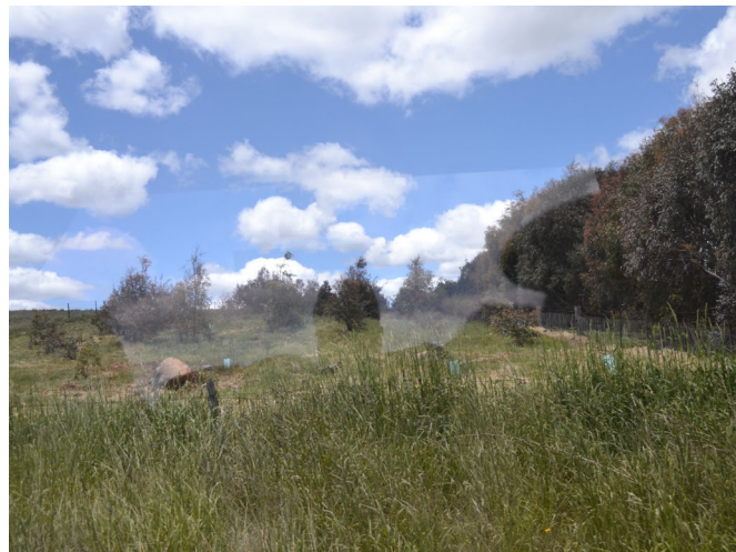
View of new plantings at southern project site boundary, looking south-east

The Panel viewed the southern boundary of the project area from Dungeon Road, including new plantings.