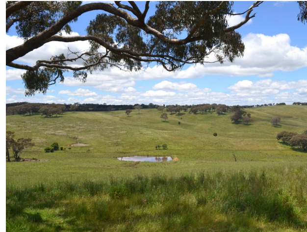
View of proposed open cut mine and waste rock emplacement, looking east