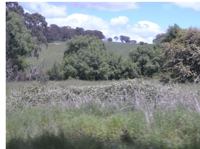
View towards west of project site from Dungeon Road, showing Tributary A of the Belubula River in foreground