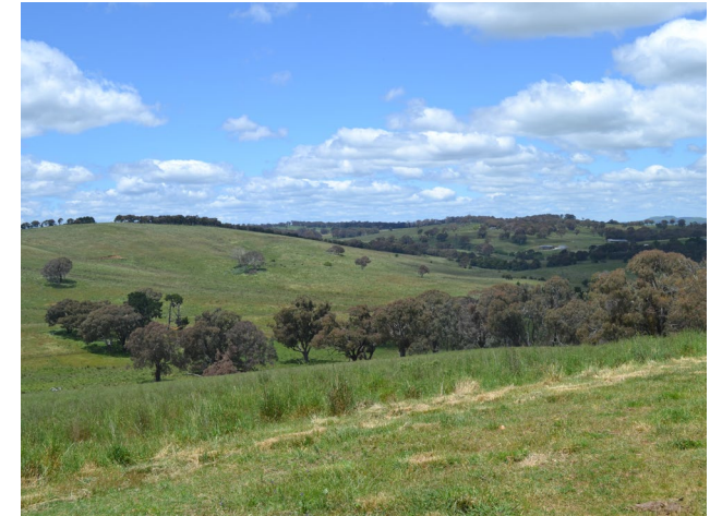
View of proposed open cut mine and southern amenity bund, looking south-east