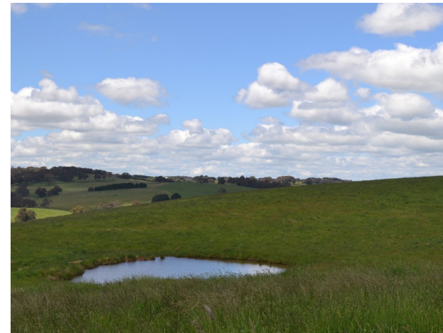
View of proposed tailings storage facility, looking south-east