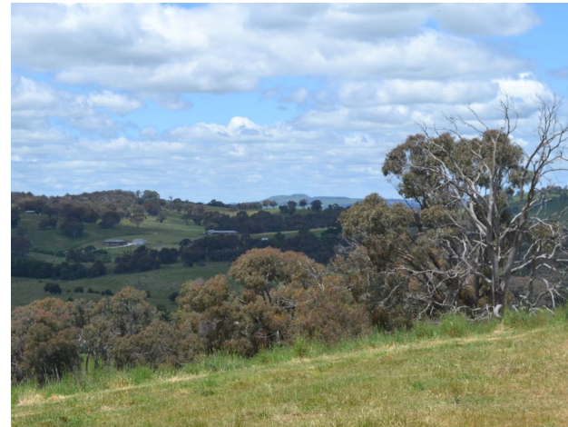
View of proposed open cut mine and pit amenity bund, looking south