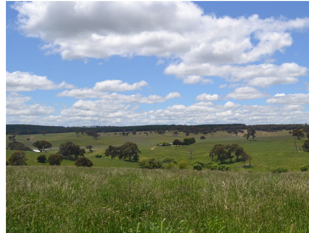
View of proposed tailings storage facility location, looking east