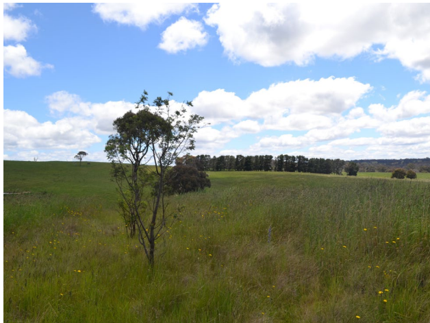
View of proposed tailings storage facility, looking north-east