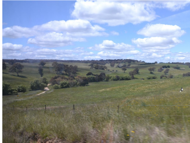
View of the Belubula River uphill from crossing with Dungeon Road, looking south-west