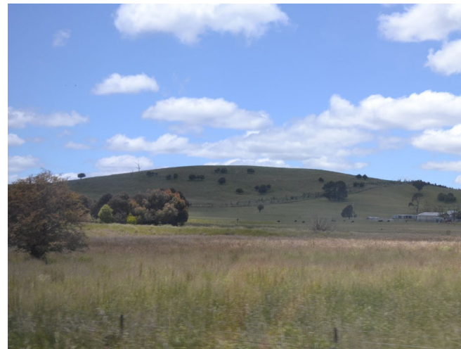
View of southern project site boundary, looking south-east