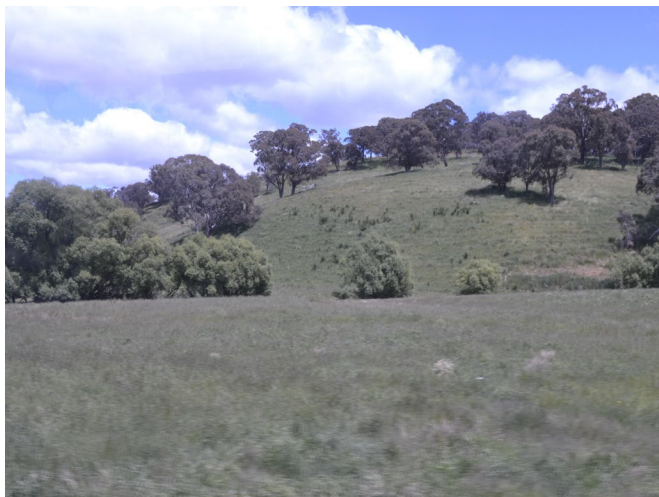
View towards south-west of project site from Dungeon Road, showing Tributary A of the Belubula River at image centre

The Panel viewed the entrance to the project site from the Mid Western Highway and continued into the site via Dungeon Road, passing Tributary A of the Belubula River.