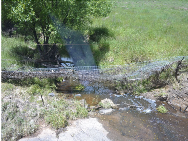
View of the Belubula River at crossing with Dungeon Road, looking west

The Panel viewed the crossing of Dungeon Road with the Belubula River.