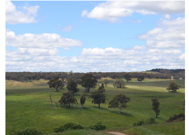
View of proposed tailings storage facility location, looking east (including Vittoria State Forest visible at image centre right)