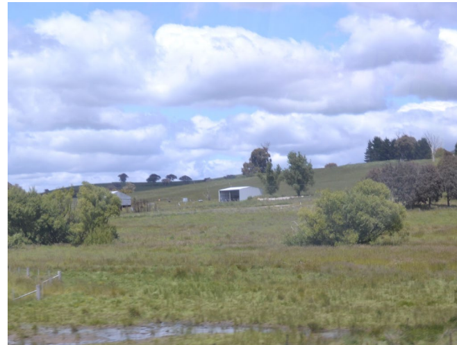
View of 61 Walkom Road from southern side of the Mid Western Highway, directly south of the project site.