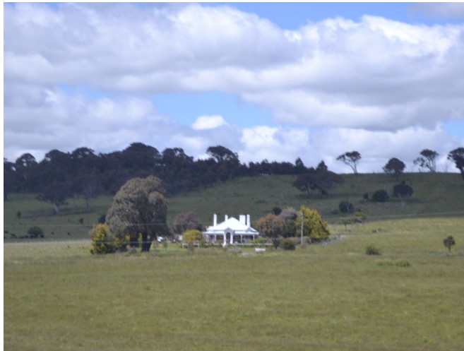
View of 84 Walkom Road from the southern side of the Mid Western Highway, directly south of the project site.

The Panel viewed properties along the Mid Western Highway and Walkom Road, Kings Plains. The Panel viewed the proposed locations of the mine pit, amenity bund, waste rock emplacement area and southern amenity bund from the south.