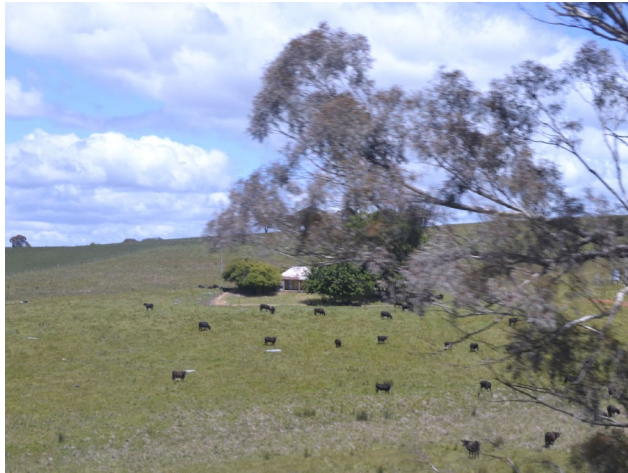
View of the Hallwood House complex, looking west

The Panel viewed the proposed location of the tailings storage facility from Dungeon Road, and the Hallwood House complex.