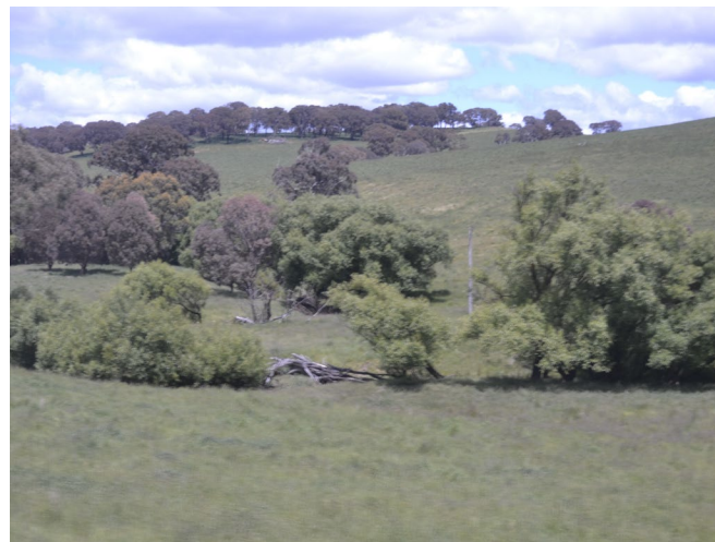
View towards west of the project site from Dungeon Road, showing Tributary A of the Belubula River at image centre