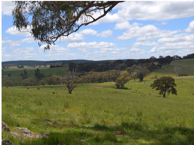
View of proposed open cut mine and ROM pad, looking north-east