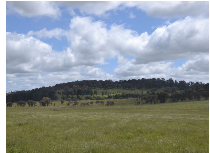
View towards southern boundary of the project site, showing the proposed amenity bund location.