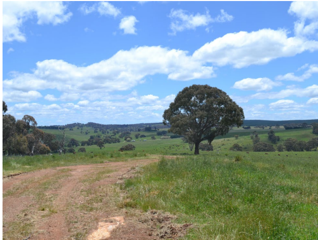
View of proposed open cut mine, looking north

The Panel viewed the proposed locations of the open cut mine, run-of-mine (ROM) pad, waste emplacement and southern amenity bund.