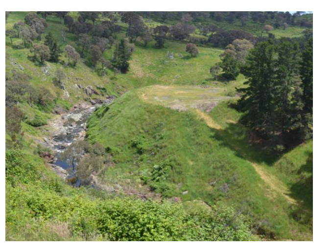
View of Belubula River from Carcoar Dam, looking south-west