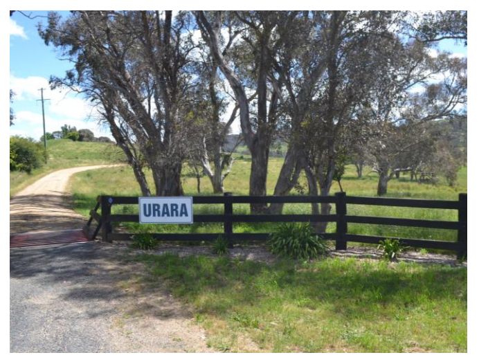
View of Urara gateway off shoulder of Mid Western Highway, looking south-west.

The Panel viewed the location (at the gateway of 'Urara' at Mid Western Highway, Bathampton) of the proposed water supply pipeline road crossing of the Mid Western Highway.