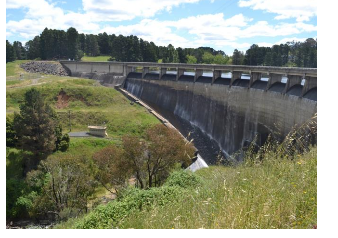
View of Carcoar Dam from Carcoar Dam Road, looking west

The Panel travelled around Carcoar Lake, passing Carcoar Dam, the Belubula River and Carcoar Freecamp and Windfarm.