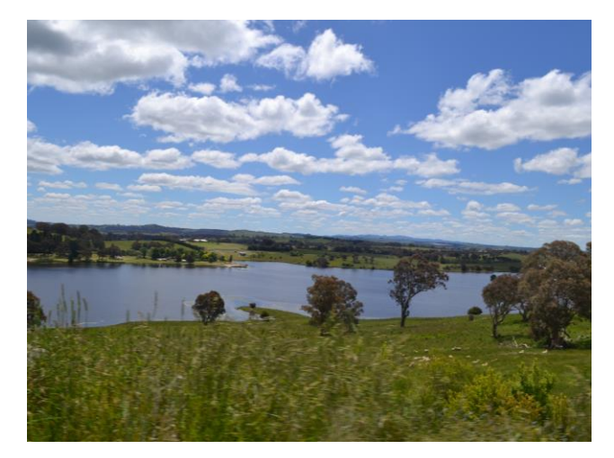
View of Carcoar Lake from Carcoar Dam Road, looking west