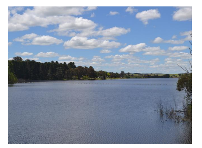
View of Carcoar Lake from Carcoar Dam Road, looking north