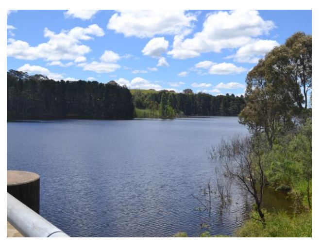
View of Carcoar Lake from Carcoar Dam Road, looking north-east