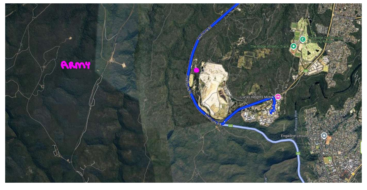
Lucas Heights facility, next to Heathcote road. Less Transport, less pollution