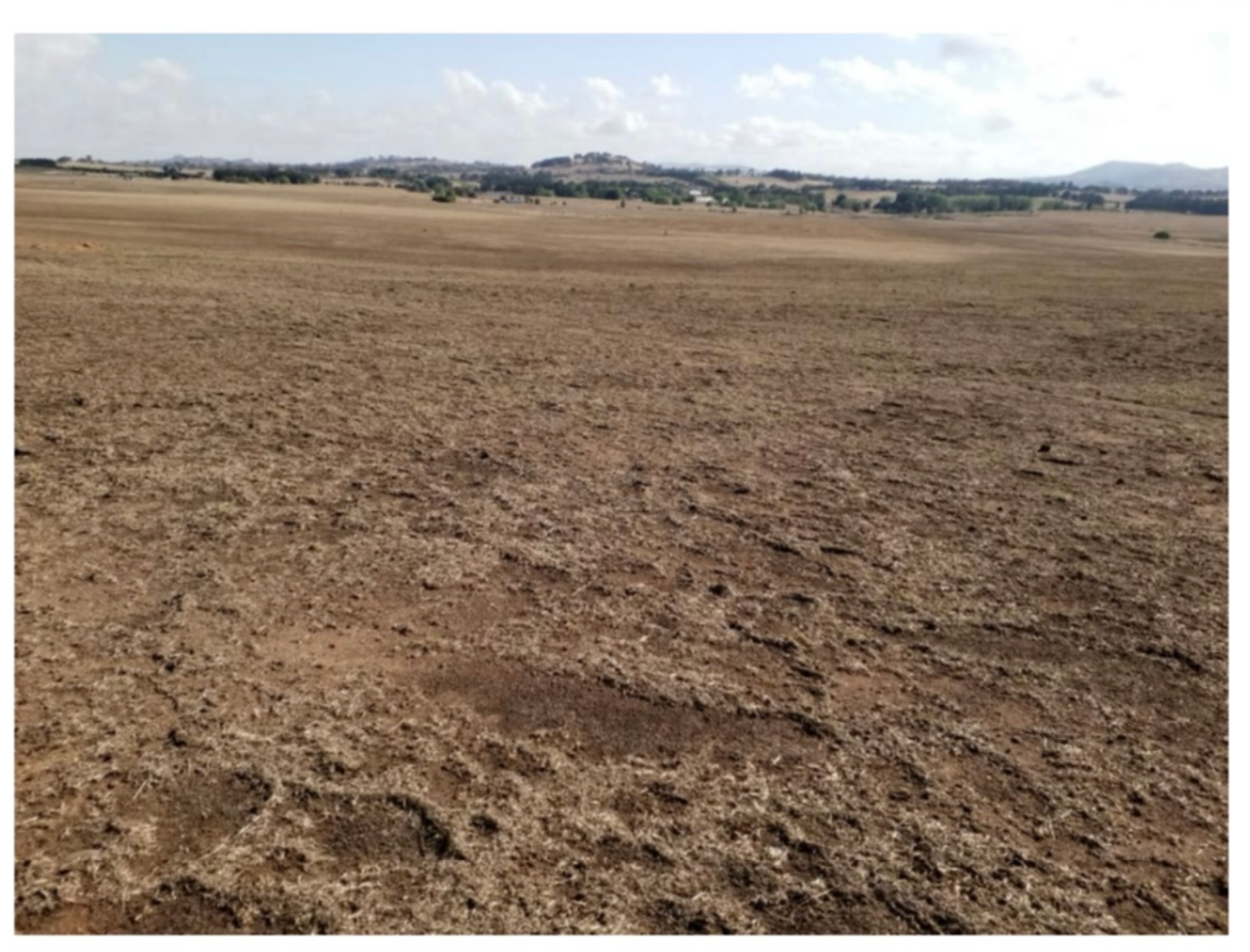
Figure 3-1 View of the eastern side of the development site, dominated by exotic vegetation

Land Category Assessment Wallaroo Solar Farm