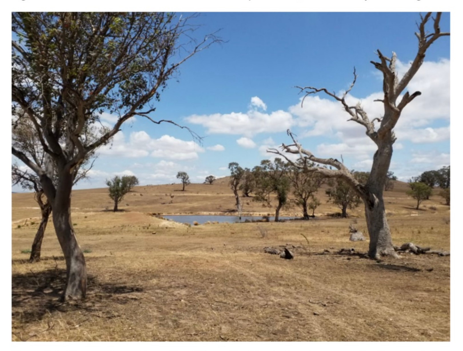
Figure 3-2 View of the western side of the subject land, showing areas of native vegetation