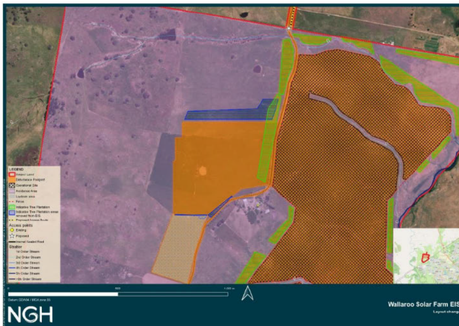
Figure 6-1 Changes since the exhibition of the EIS