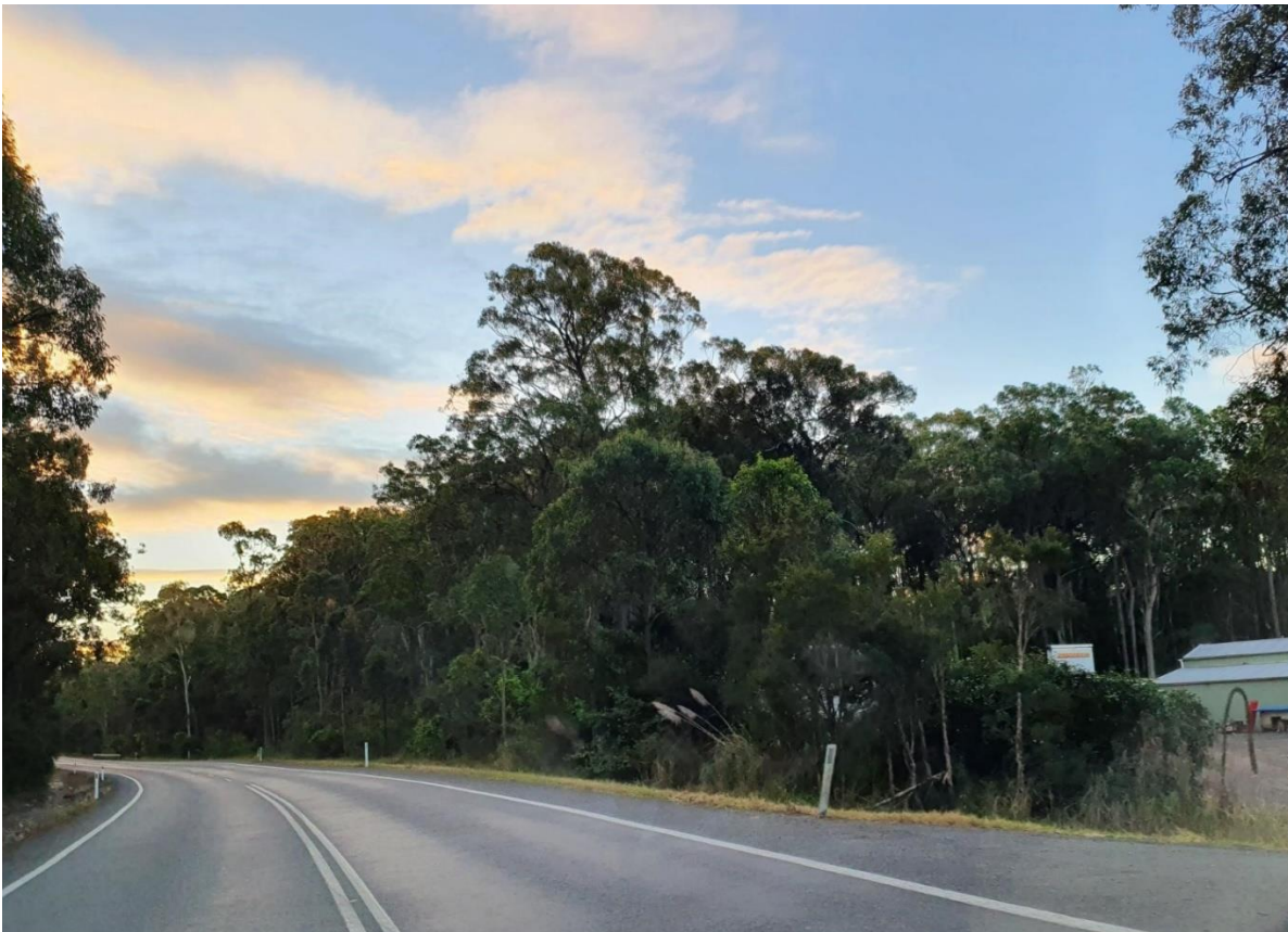
Figure 4: Neighbour to the east.