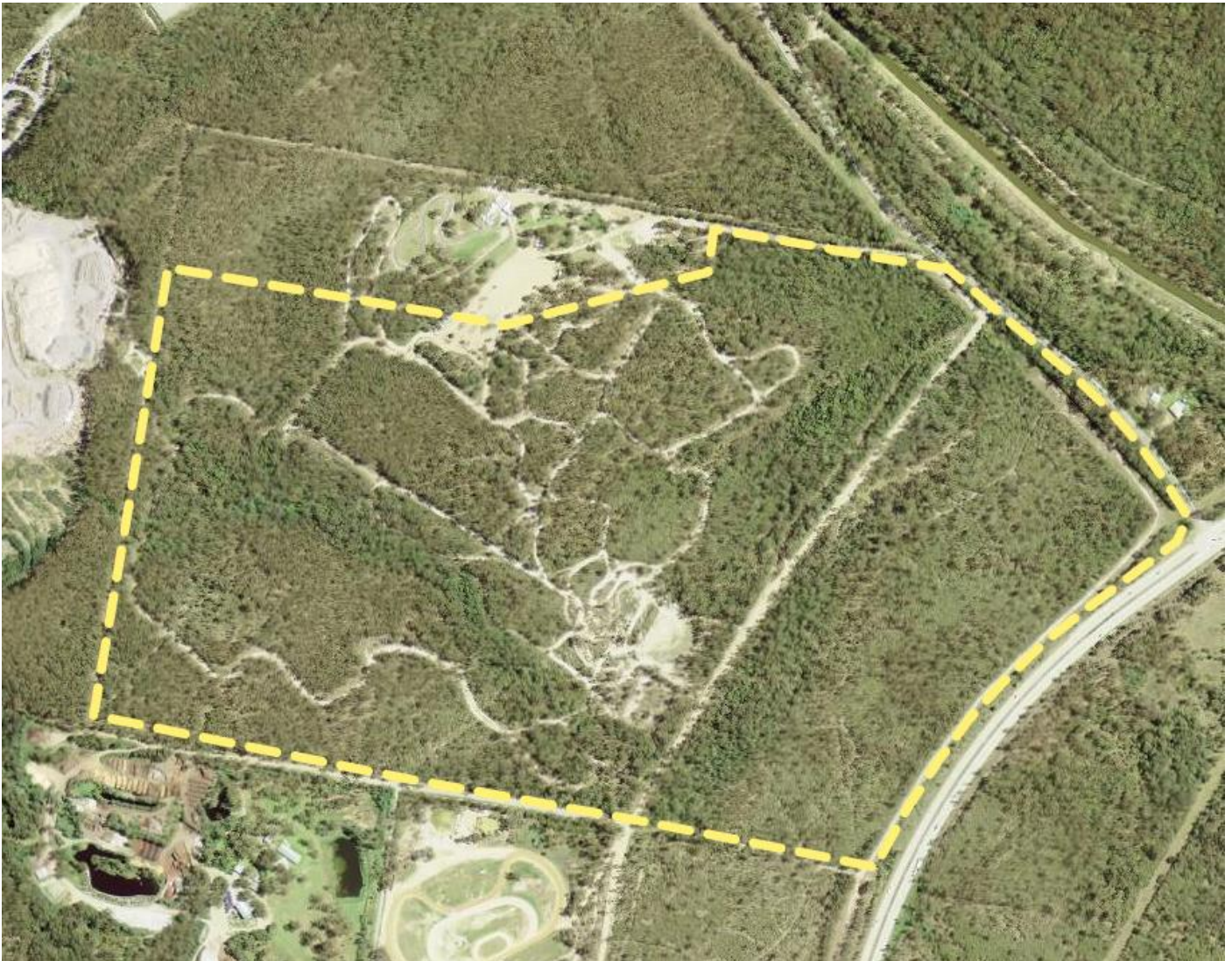
Figure 2: Aerial view of the site.

The site is heavily vegetated in the areas not cleared for the roads.