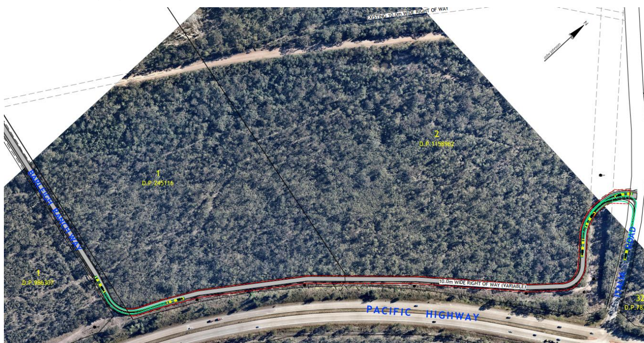
Figure 1: Proposed road outlined in red.