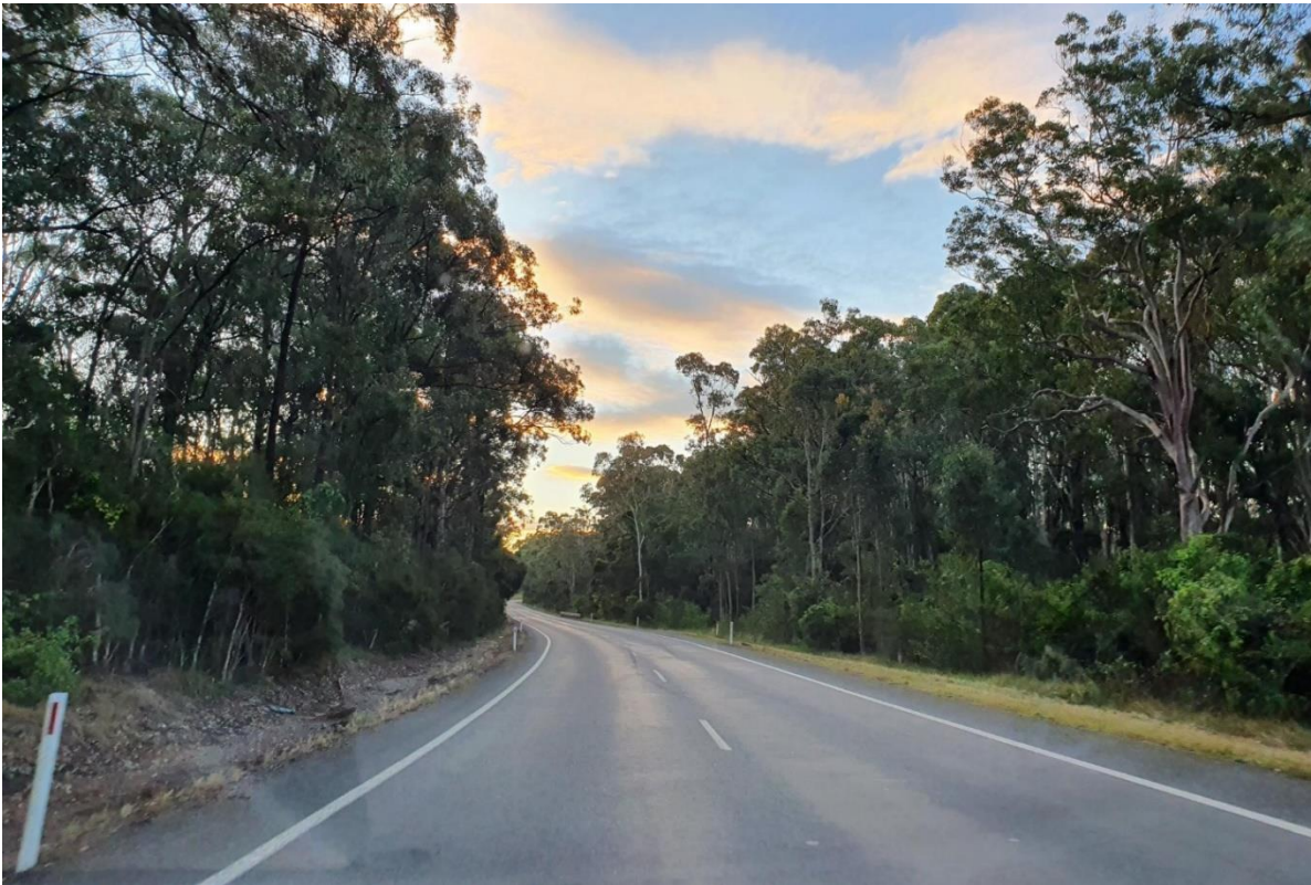
Figure 3: Approximate new intersection location.

A site inspection was carried out on 11 June 2021. The subject site can be seen in the images below: