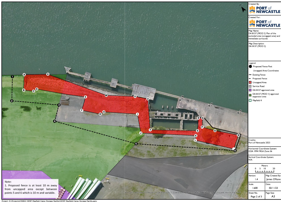
Figure 7 | Plan of the excluded area (uncapped area) and immediate surrounds