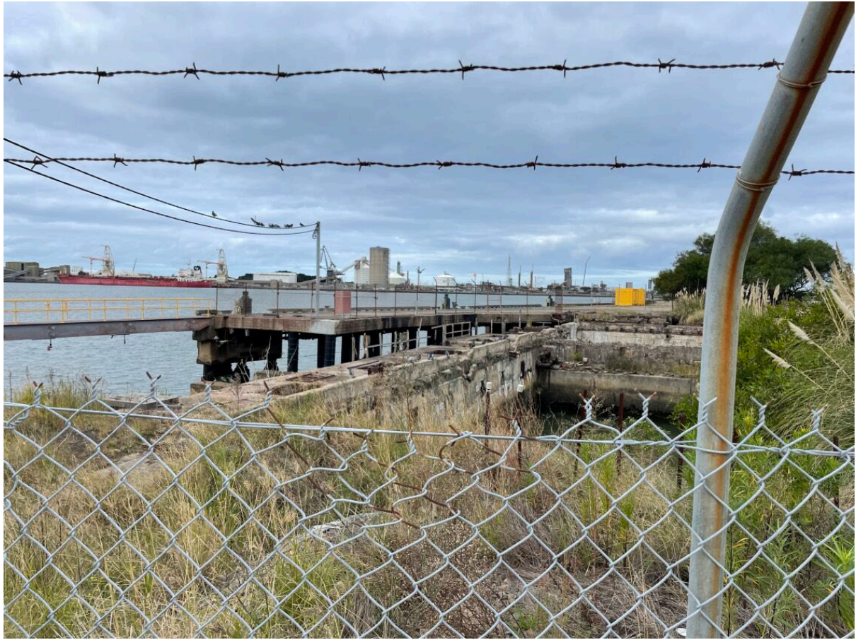
Figure 9 | Koppers Operational Area