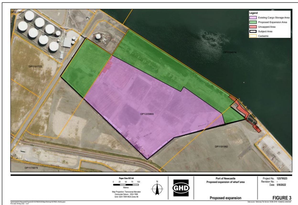
Figure 4 | Mayfield Cargo Storage Area – Expansion Area MOD 1

1.3.3 The Applicant has not yet satisfied Conditions B9 and B10 and commenced operations in the expanded storage area.