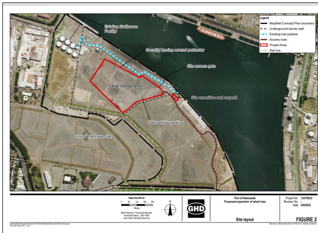
Figure 3 | Mayfield Cargo Storage Area DA 8137