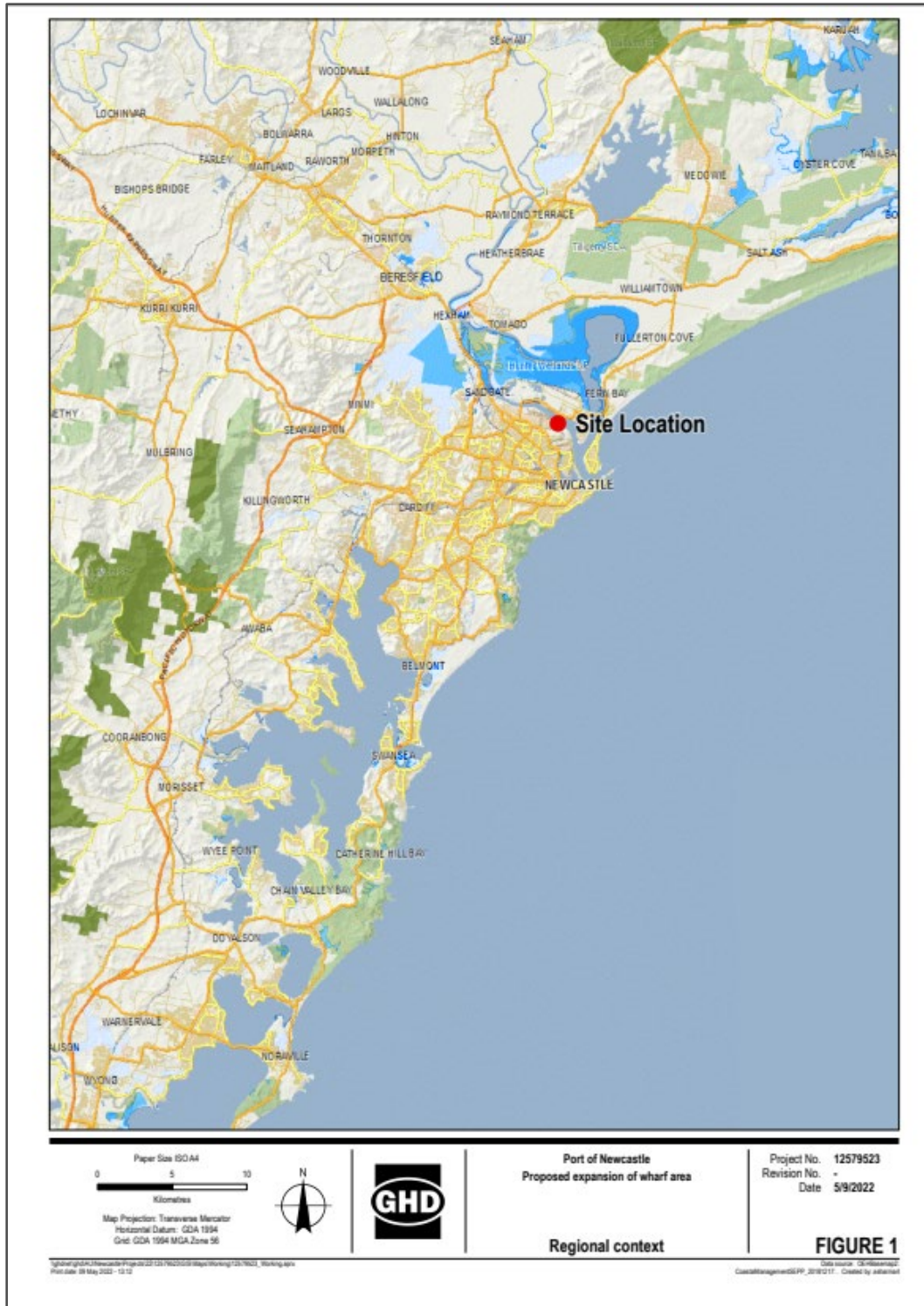
Figure 1 | Regional Context Map