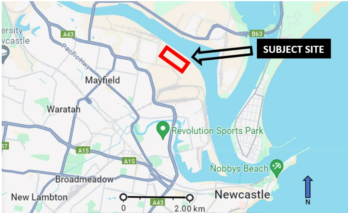
Figure 2 | Local Context Map