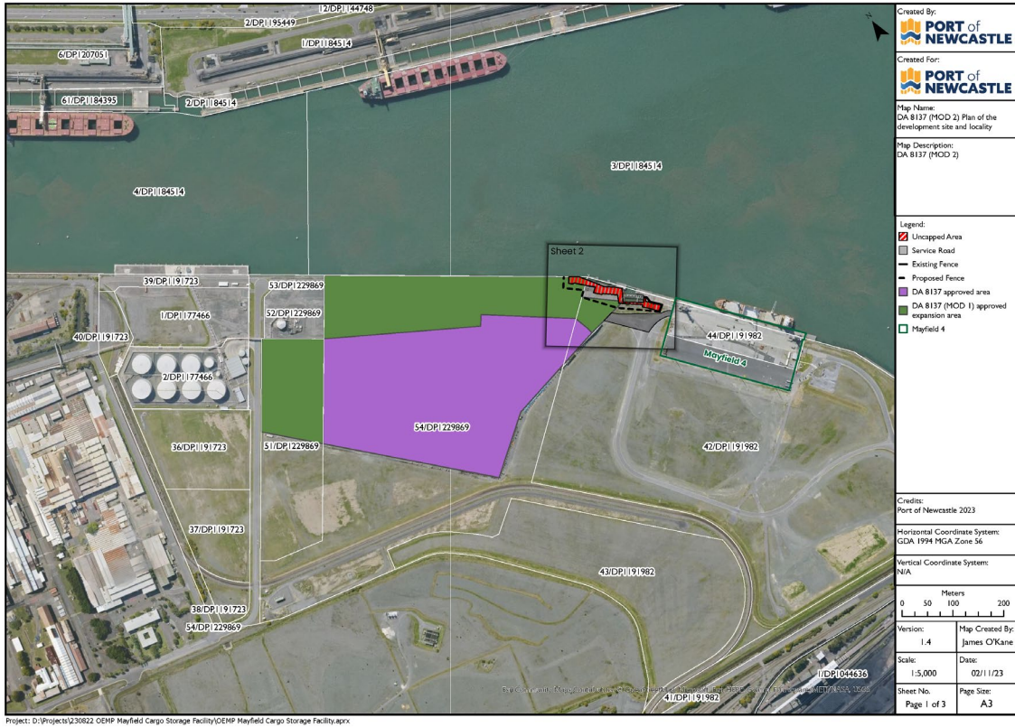
Figure 6 | Plan of the development site and locality