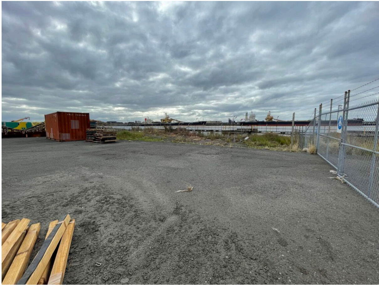
Figure 8 | Cargo adjacent to unremediated land