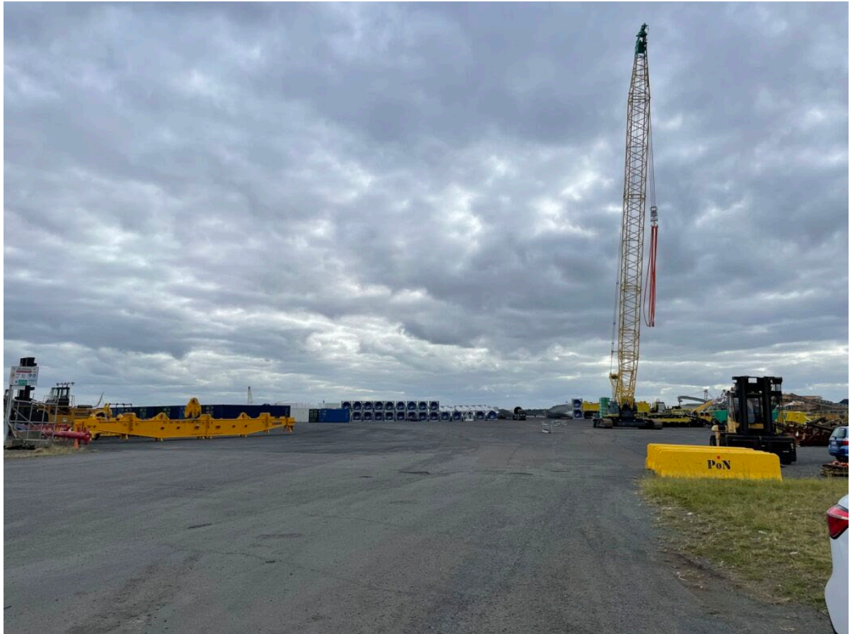
Figure 10 | MCSF cargo storage area