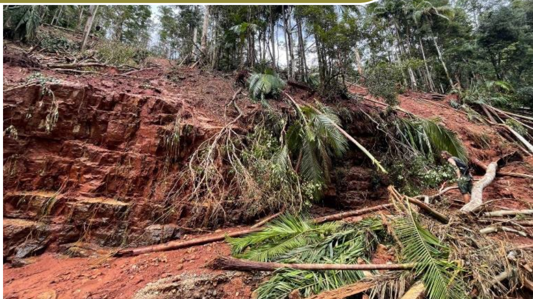
Huonbrook and Wanganui valley

-Hinterland resident, recounting the scene after 28 February 2022