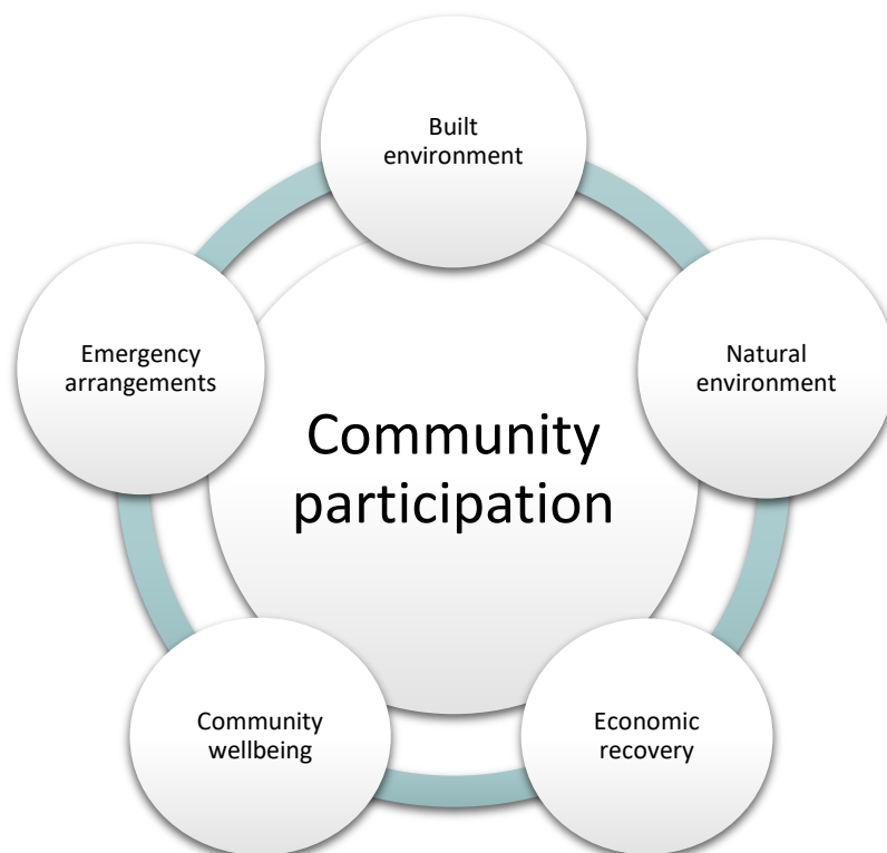
Five dimensions of recovery in the Recovery Action Plan

The five domains of our disaster recovery framework are presented in Figure 2, noting that community participation is integrated across all of these areas. Community participation means appropriate and meaningful engagement across our recovery activities, noting that the form and scope of community involvement may vary depending on the nature and significance of the activity. A substantial degree of disaster recovery will be instigated and led by community, and we will receive input and guidance from community stakeholders to optimise what we deliver.