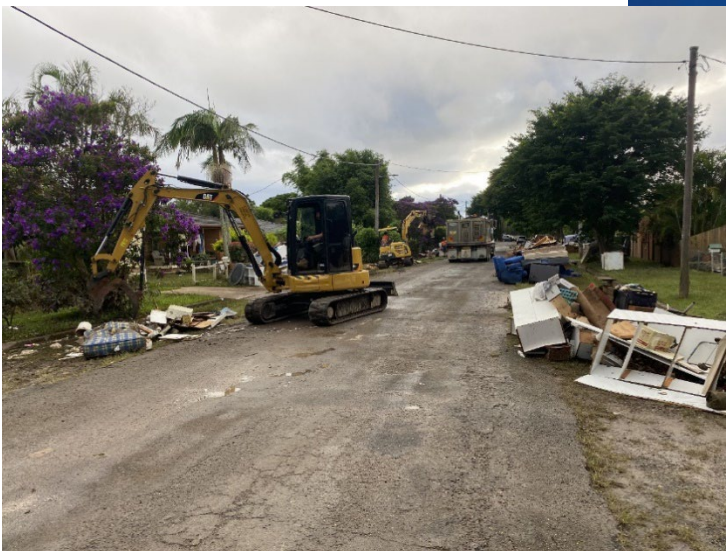
Clean up in Mullumbimby

In collaboration with state government and a local landowner, Council also facilitated supplies and waste management solutions by helicopter for isolated Huonbrook residents.