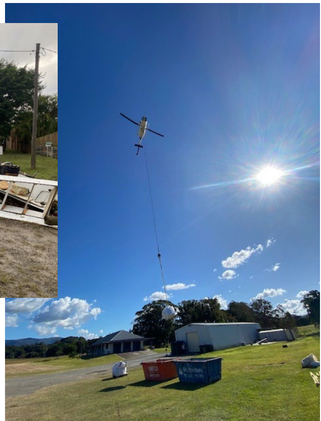
Helicopter pick up for Huonbrook