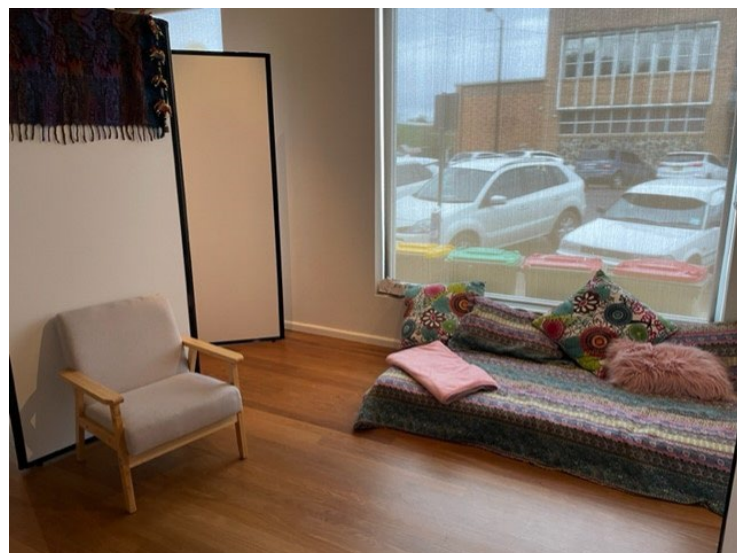
Private area in Recovery Centre

Supplementing the Recovery Centre, service providers participated in mobile recovery street teams across the Shire to increase awareness of and access to recovery services.