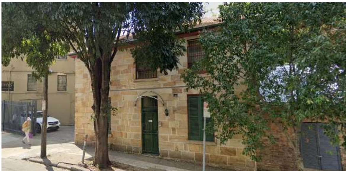
Figure 4: Street view (obscured) of the two-storey sandstone workers cottage at 549 Glenmore Road Edgecliff from Glenmore Road facing east