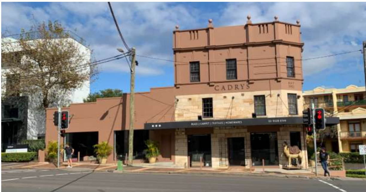
Figure 3: Cadry's Building, 133 New South Head Road, Edgecliff viewed from New South Head Road facing south