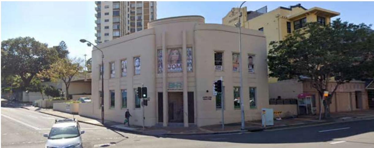
Figure 2: Street view of 136 New South Head Road Edgecliff at the corner of Darling Point Road, facing north-east

On 5 July 2021 Council also resolved that the cottages at 543-549 Glenmore Road should be investigated to determine whether these buildings fulfil the criteria for heritage listing (see Figures 4 & 5 ). 2