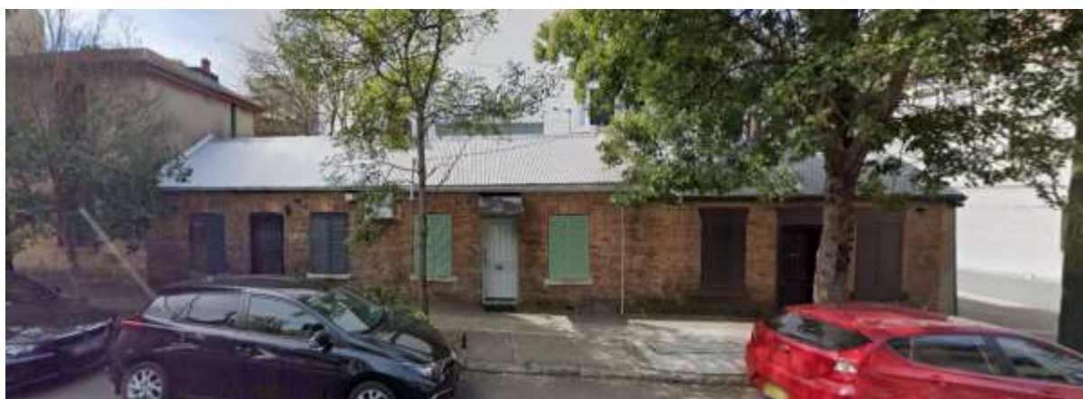
Figure 5: Street view of the three single storey timber workers' cottages at 543-547 Glenmore Road Edgecliff from Glenmore Road facing east