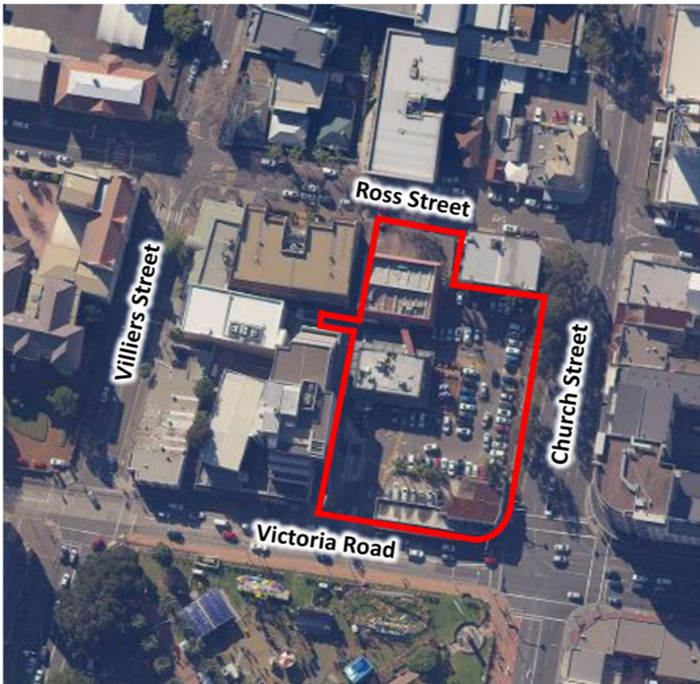
Figure 4 Aerial photograph of the site context, site bound in red