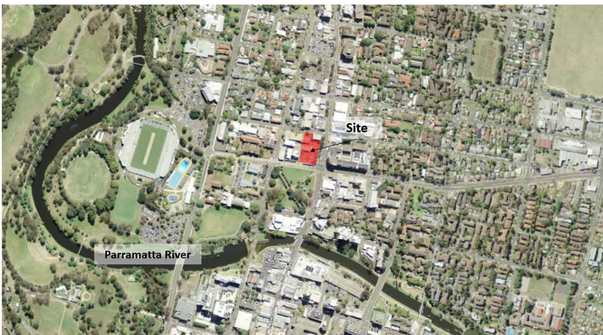
Figure 5 Aerial photograph of the broader site context in relation Parramatta CBD, site bound in red