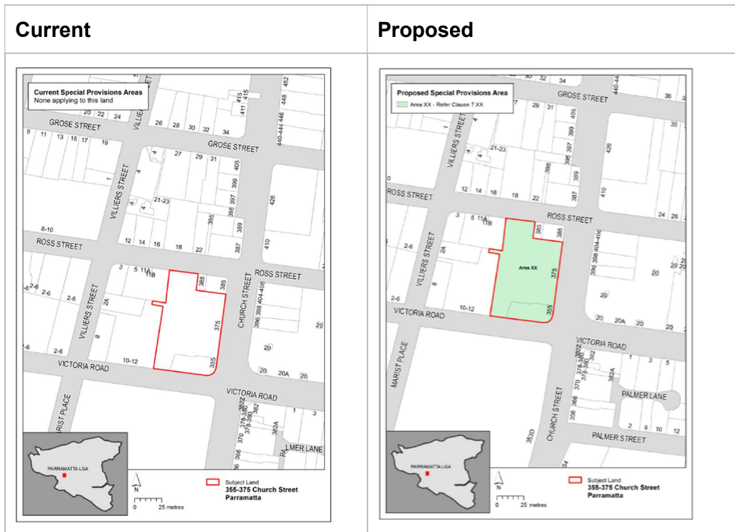
Figure 6 Current and proposed Key Sites, Special Provisions and Sun Access Protection Map