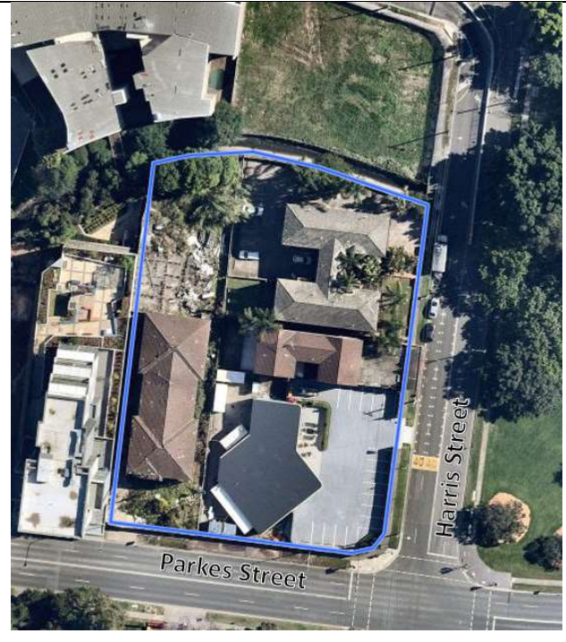
Figure 1 site location (NearMap with DPE edits)

East of the site exists the mid-sized Robin Thomas Reserve ( Figure 2 ). This reserve is one of the few open spaces in the city centre and contributes to the character and amenity of the area. To the south of the site, across Parkes Street, are apartment buildings that are estimated to date from the 1970s and 1980s. Immediately adjoining the northern site boundary is Clay Cliff Creek, an open concrete channel. To the site's west is a recently completed and occupied residential tower at 22 Parkes Street and at 14 - 20 Parkes Street, Parramatta development consent has been issued for mixed use development following a recent rezoning.