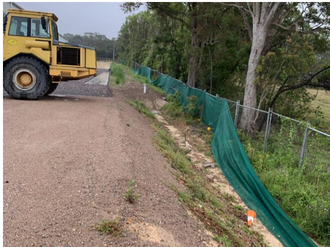
Location 2 – Location of proposed Noise Wall and existing Vehicle Wash Bay