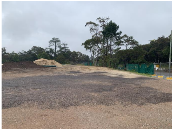
Location 1 – Site Access