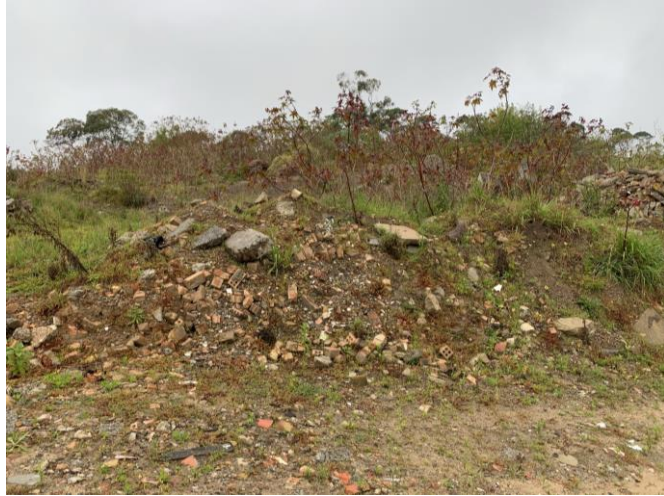
Location 4 – Processing Area with legacy construction waste