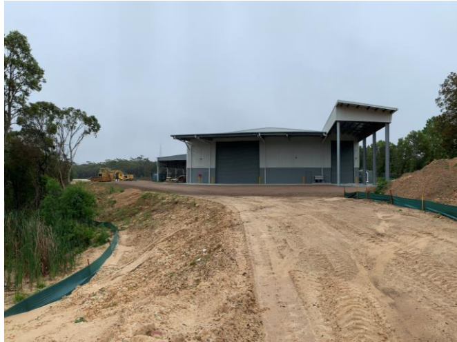
Location 6 – Stage 1 Area