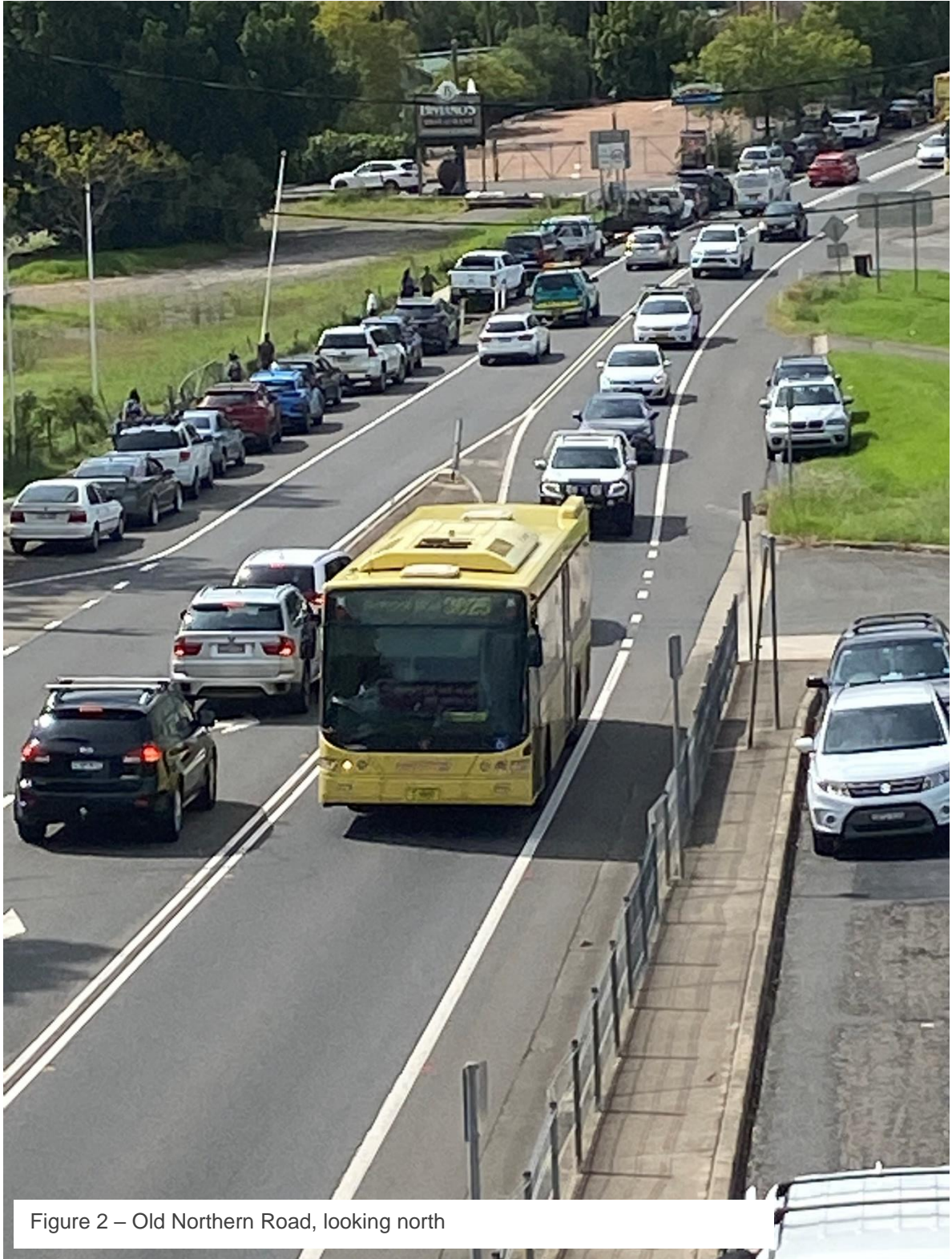
Figure 2 – Old Northern Road, looking north