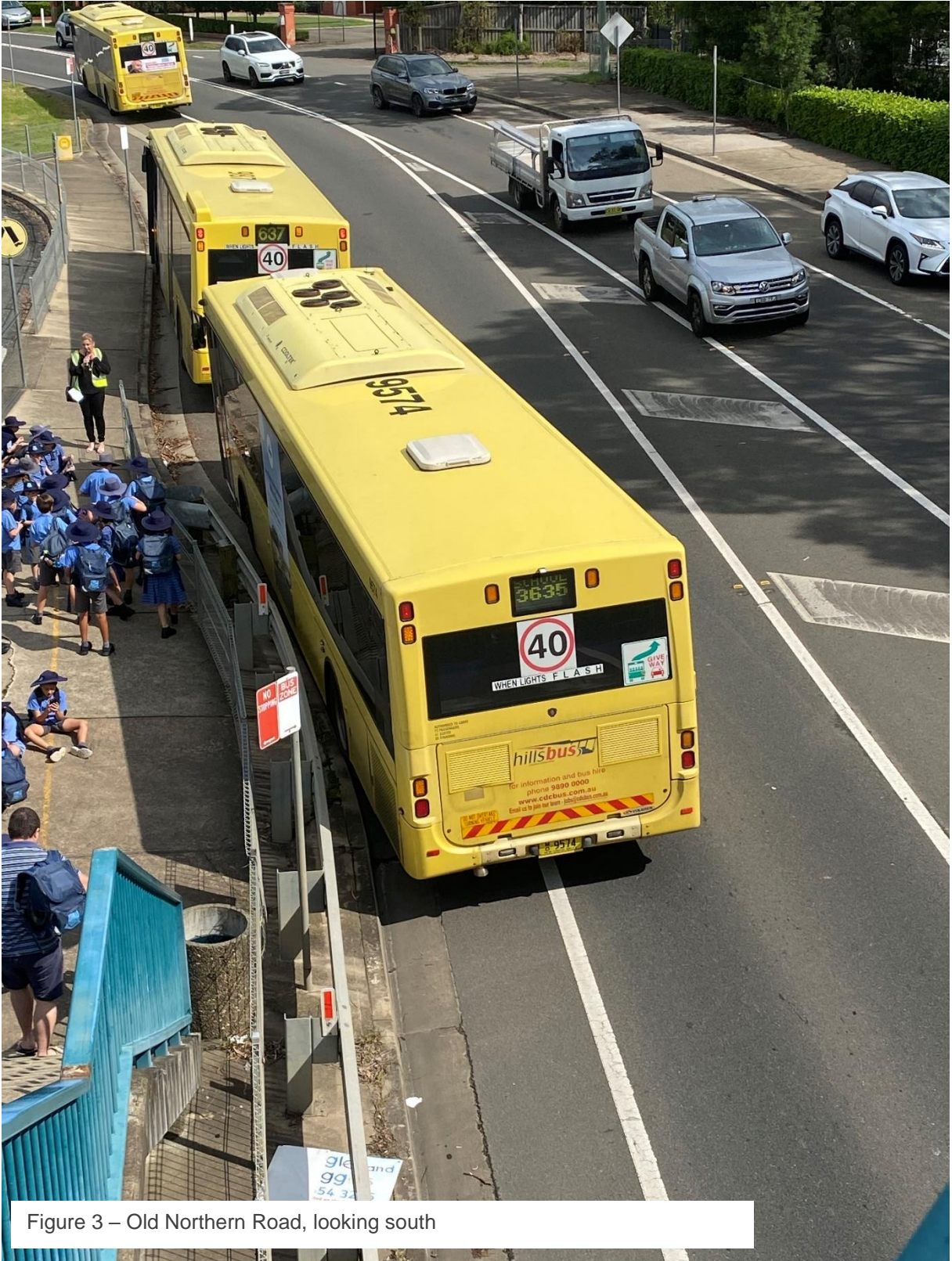
Figure 3 – Old Northern Road, looking south