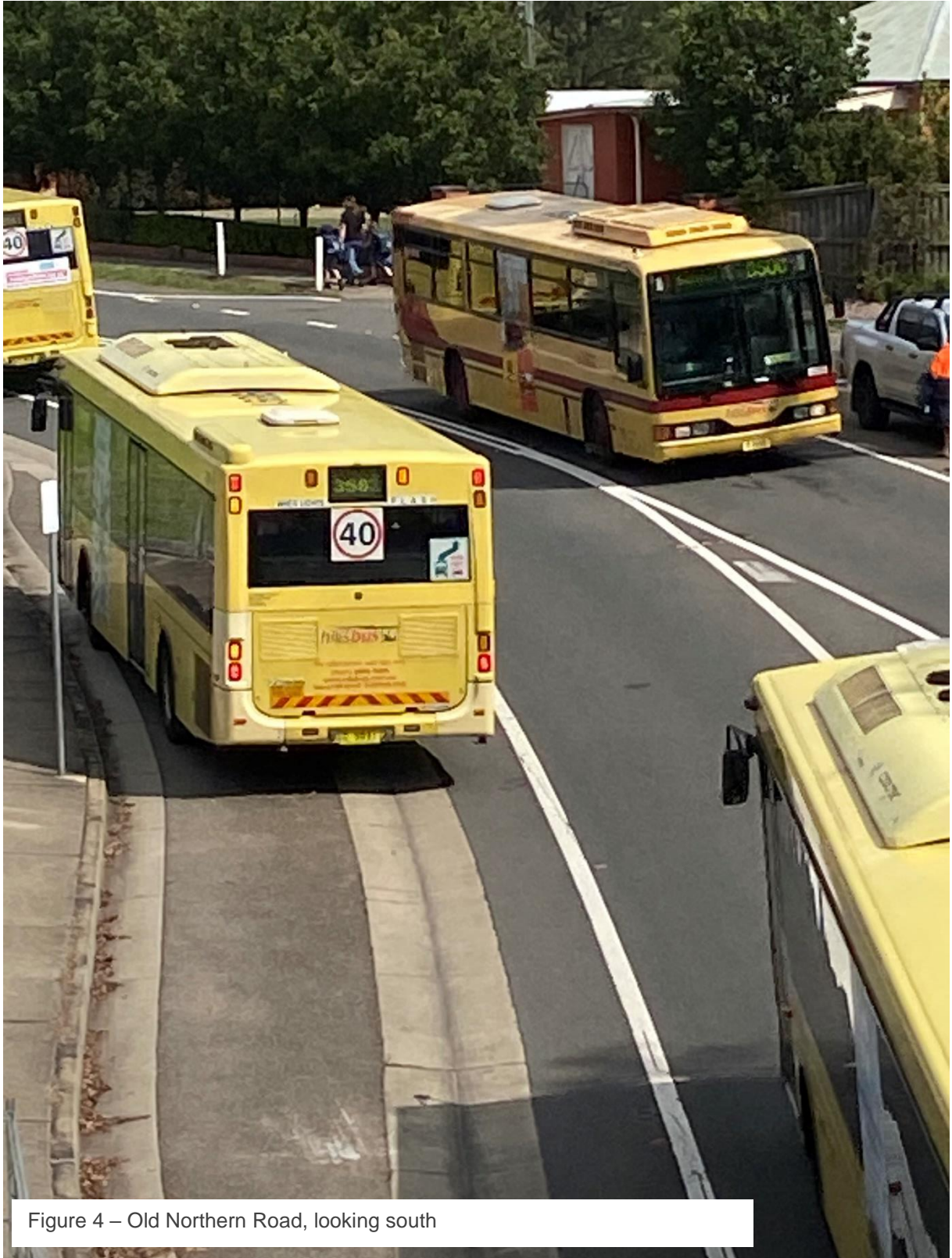
Figure 4 – Old Northern Road, looking south