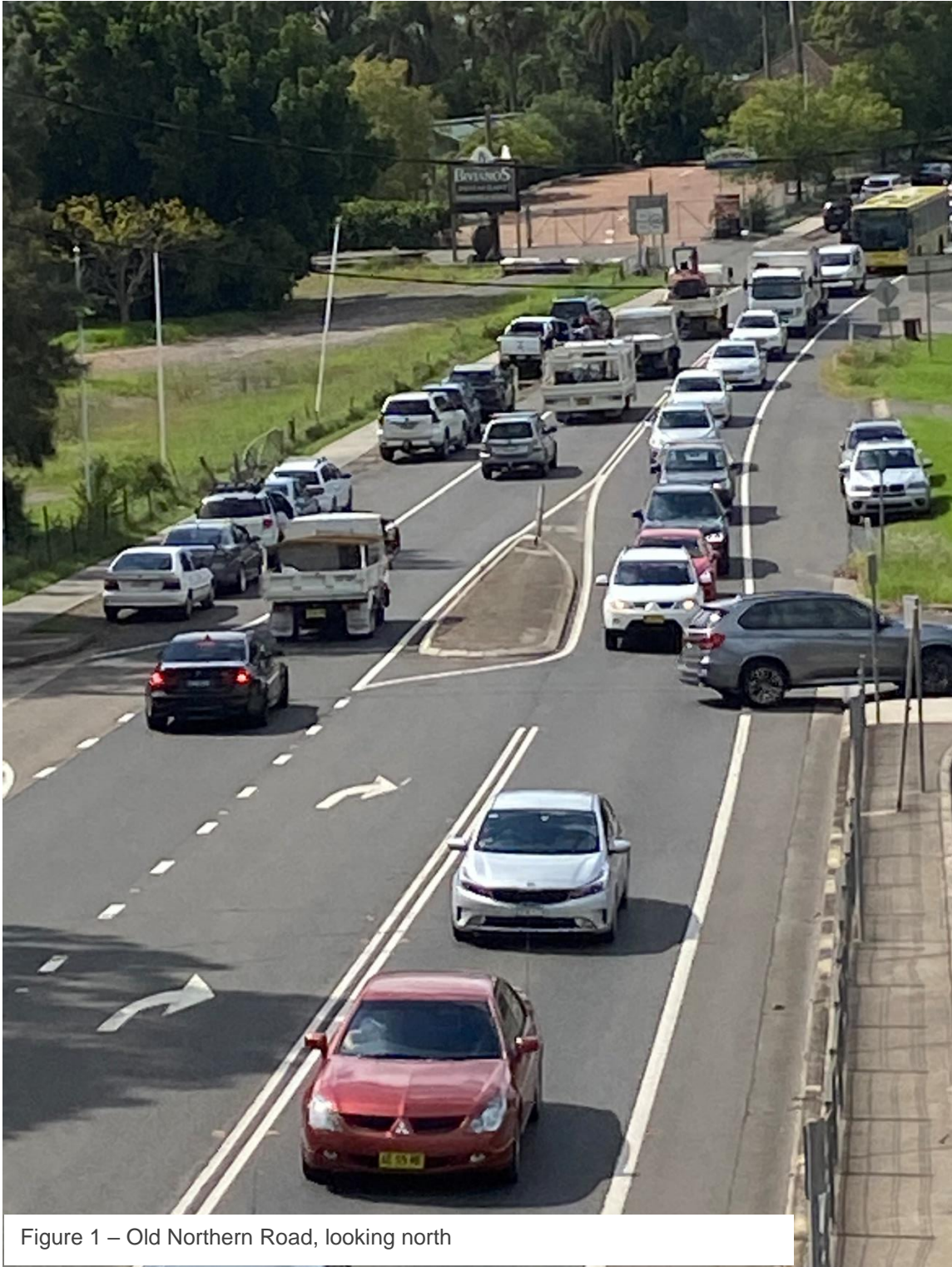
Figure 1 – Old Northern Road, looking north