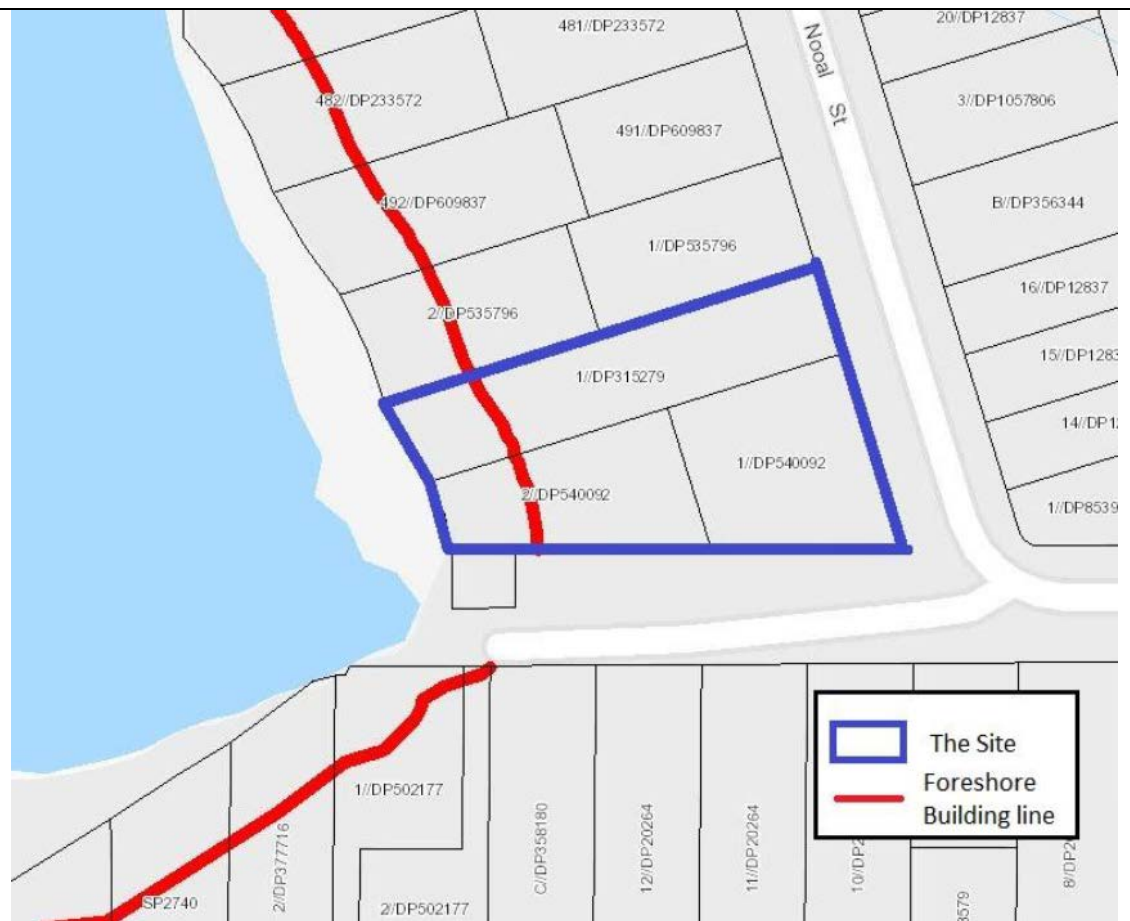
Figure 6: Foreshore building line

The original planning proposal submitted to Council by Boston Blyth Fleming Town Planners on behalf of Crystal Apartments Pty Ltd sought to amend Schedule 1 of Pittwater LEP 2014 to permit seniors housing as an additional permitted use on the site. The supporting concept design for the proposal included eight seniors' independent units with a total floor space ratio of 0.5:1 and up a height of 8.5m.