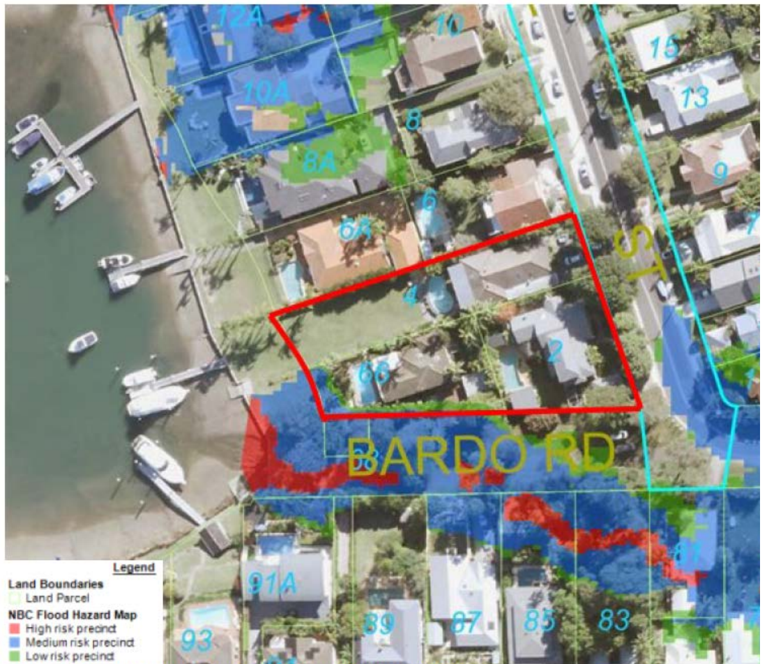
Figure 3- Northern Beaches Council Flood Hazard Map – 1% AEP Newport Flood Study 2019 - 1% Annual Exceedance Probability (AEP) flood event