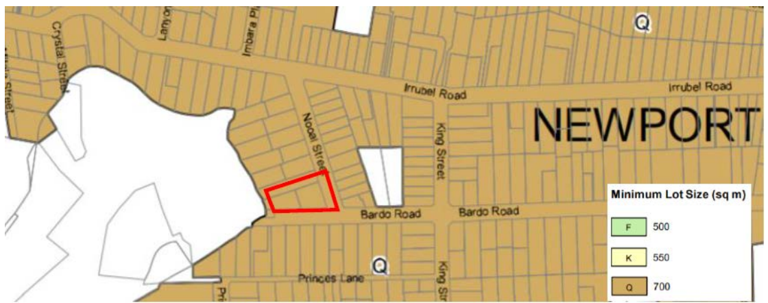
Figure 5: Existing Lot Size Map with site outlined in red