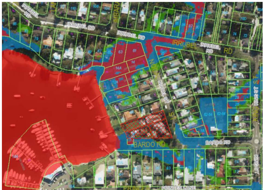
Figure 4: Draft Newport Flood Study 2018 high (red), medium (blue) and low (green) flood risk (site shown red crossed hatched)