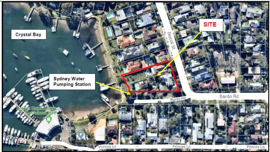
Figure 2: Aerial view of site