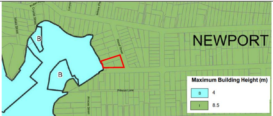
Figure 4: Existing Height of Building Map with site outlined in red