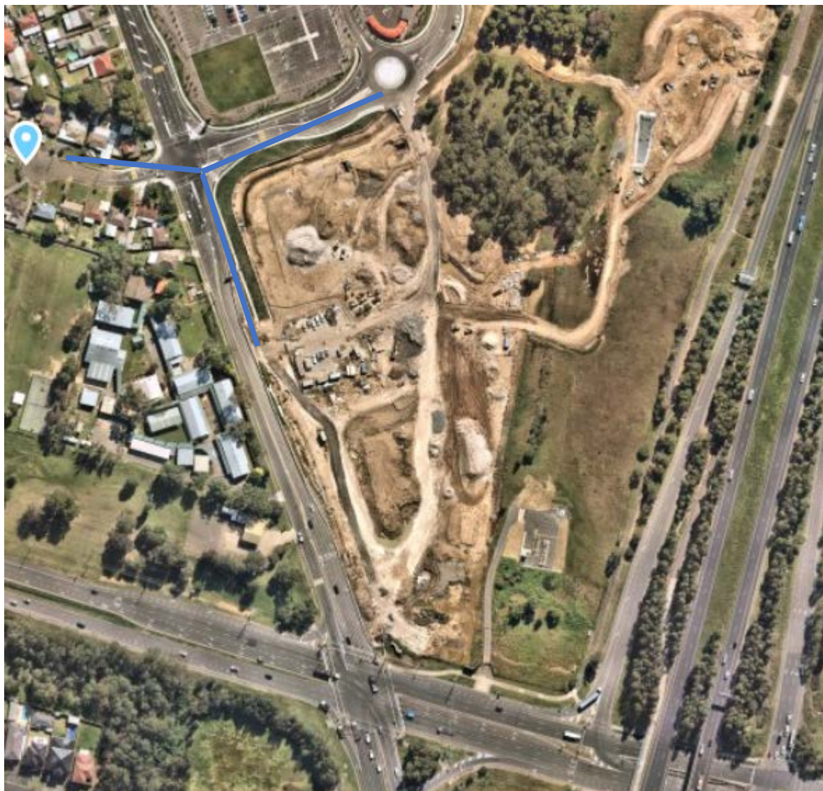
MAP 1. SSD Site lot 1