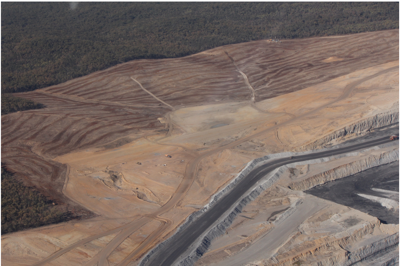
Pic: Whitehaven Coal's Maules Creek Mine (EPBC Approval 2010/5566), 2018 showing the mine's encroachment into Leard State Forest, under a raft of conditions most of which have been ignored and not enforced over the six year period since commencement.