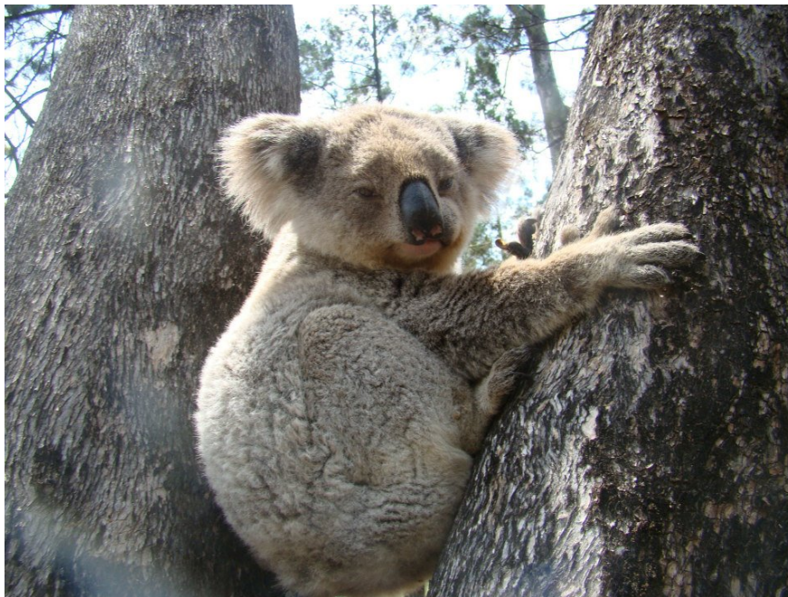
Leard Forest koala