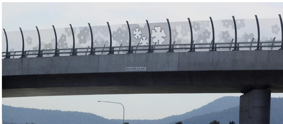
Figure 1: Bulahdelah Bypass (south Bulahdelah access bridge)