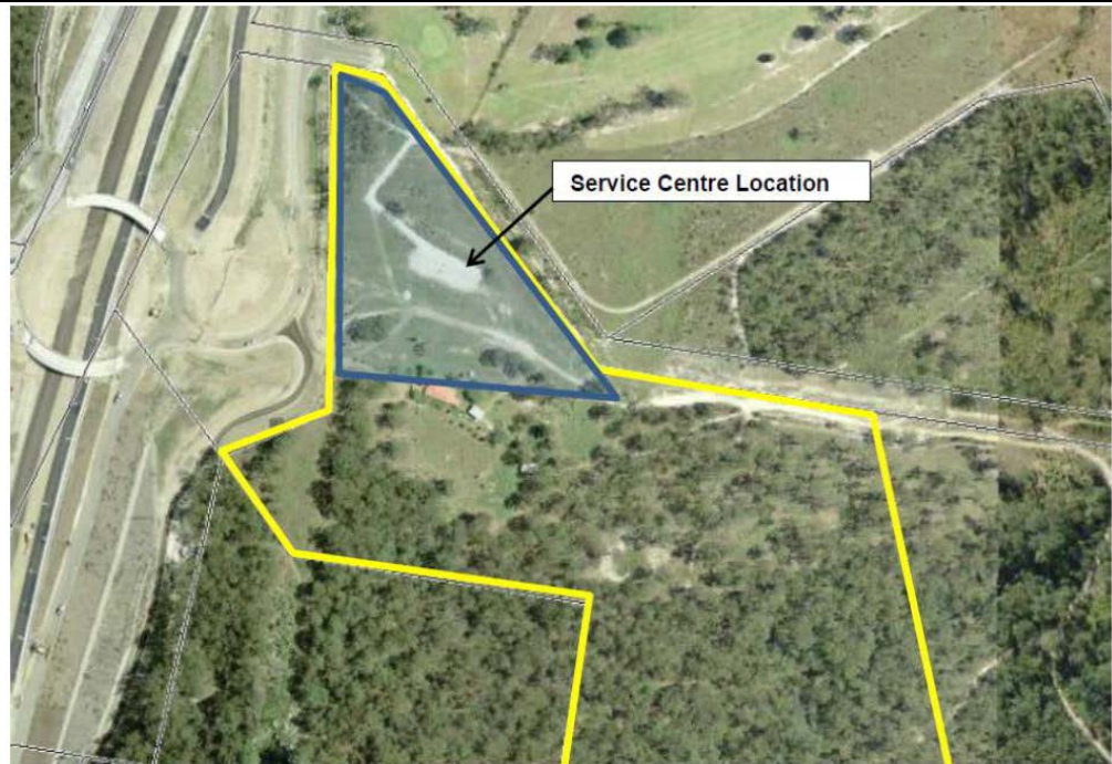
Figure 2: Detailed aerial photo of proposed highway service centre location.

The site is primarily zoned RU2 Rural Landscape, with a small portion of R2 Low Density Residential land also affected (Figure 3, below).