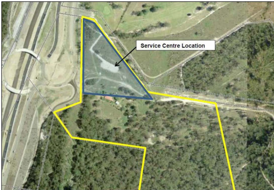
Figure 3 – Proposed Service Centre Location