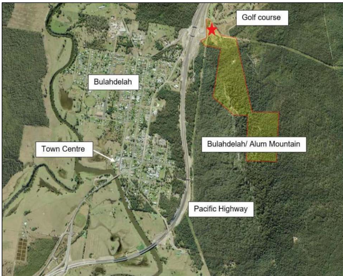
Figure 1 – Location of the Site (Source: Department's Assessment)