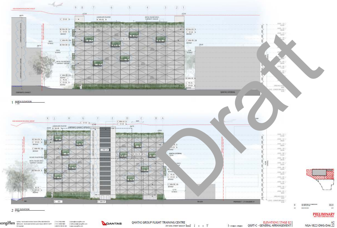
Figure 3: Car Park Elevations (North and East)

DO NOT SCALE OFF THIS DRAWING, USE FIGURED DIMENSIONS ONLY VERIFY ALL DIMENSIONS ON SITE AND DISCREPANCIES SHALL BE BROUGHT TO THE ATTENTION OF THE ARCHITECT