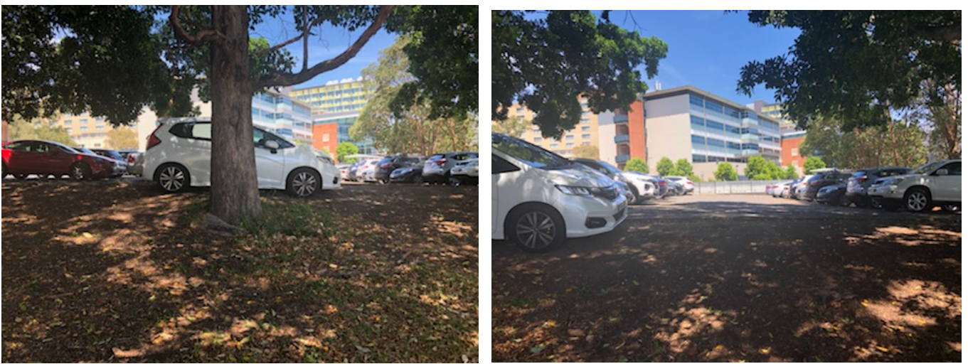
The car park is so full people are parking in the garden behind Wahroonga church on Monday 11<sup>th</sup> November at aprox 11am