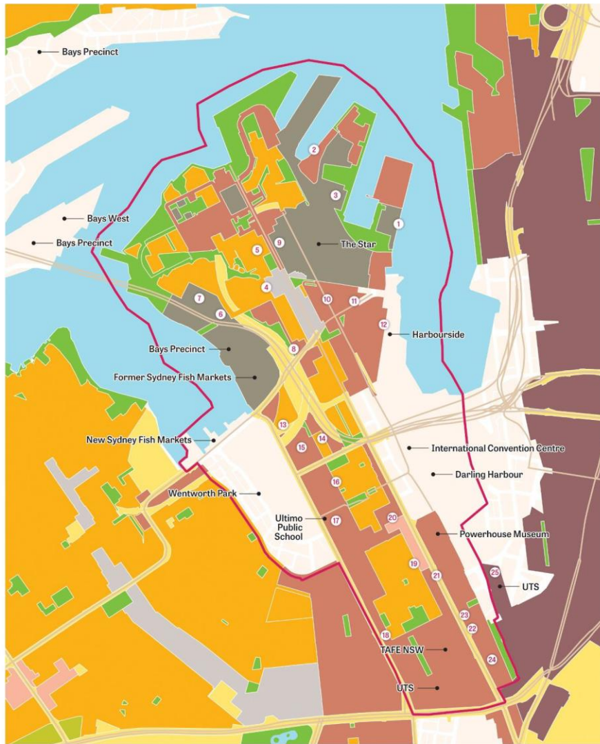
Map 6: Key locations and sites with potential capacity