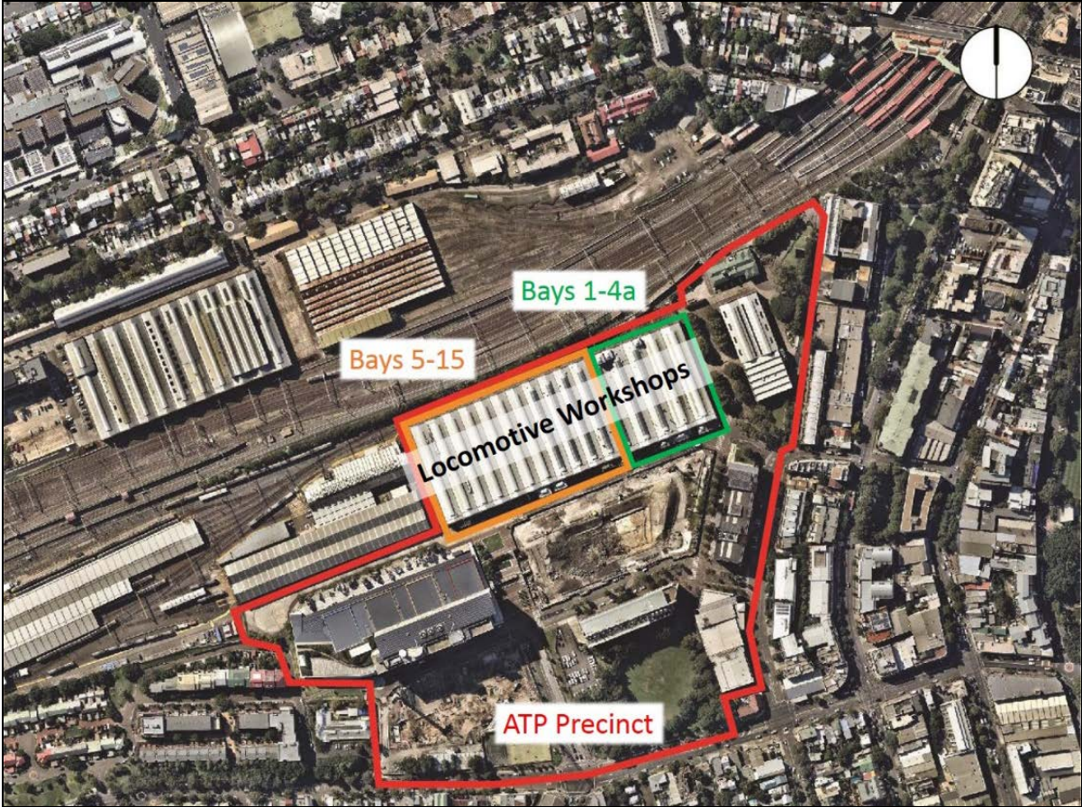
Figure 2 | Aerial view of Locomotive Workshop and ATP

The Locomotive Workshop is listed as a State Heritage Item under the NSW State Heritage Register and the Australian Technology Park S170 Heritage and Conservation Register. The Locomotive Workshop was constructed in 1887 and was used for locomotive manufacturing until 1952 when it became a repair and maintenance facility. Bays 1 to 4a contained trades, including blacksmiths and boiler makers, while Bays 5 to 15 contained machines, tool and assembly areas. The workshop shut in 1988 and converted to commercial office space in the mid-1990s.