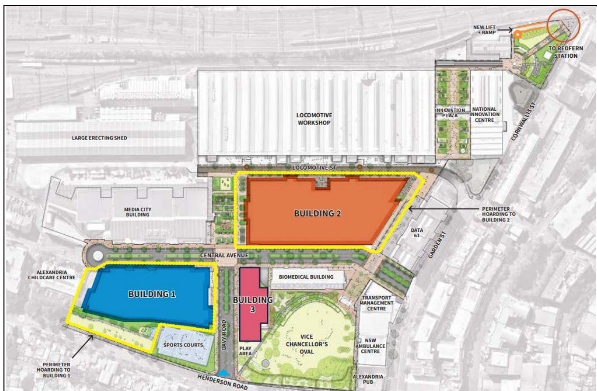
Figure 1 | The Australian Technology Park

The site is the Locomotive Workshop, located within the northern portion of the ATP. The ATP is located approximately 5 km south of the Sydney central business district (CBD), 8 km north of Sydney airport and 200 m from Redfern railway station ( Figure 1 ).