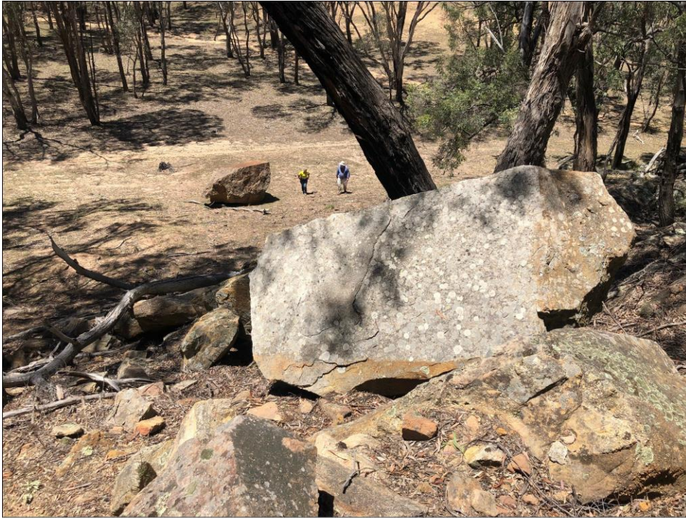
Figure 3: Rock fall that occurred around 1993 further along the same formation as the March 2014 rock fall