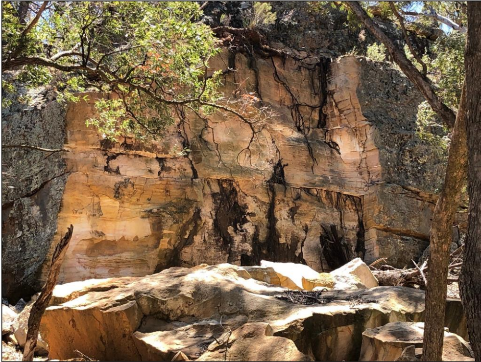
Figure 2: Rock fall that occurred on or around 18 March 2014

The rock fall site is located a short distance to the east of Cultural Site #184. The cultural site does not appear to have been directly impacted, but it is likely that all the cultural sites in the area have natural joints in the rock strata behind and are similarly vulnerable to tree root invasion over time.