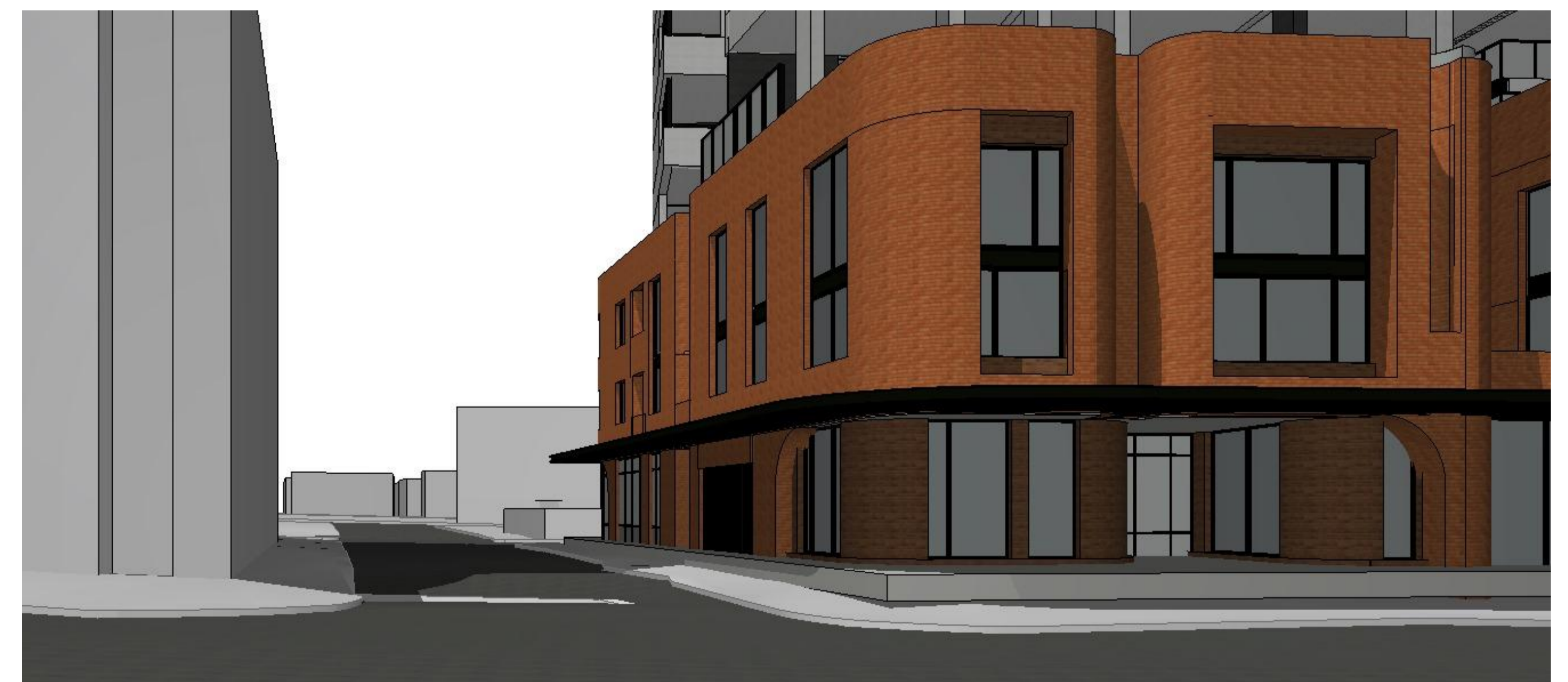
Marian Street Active Edge