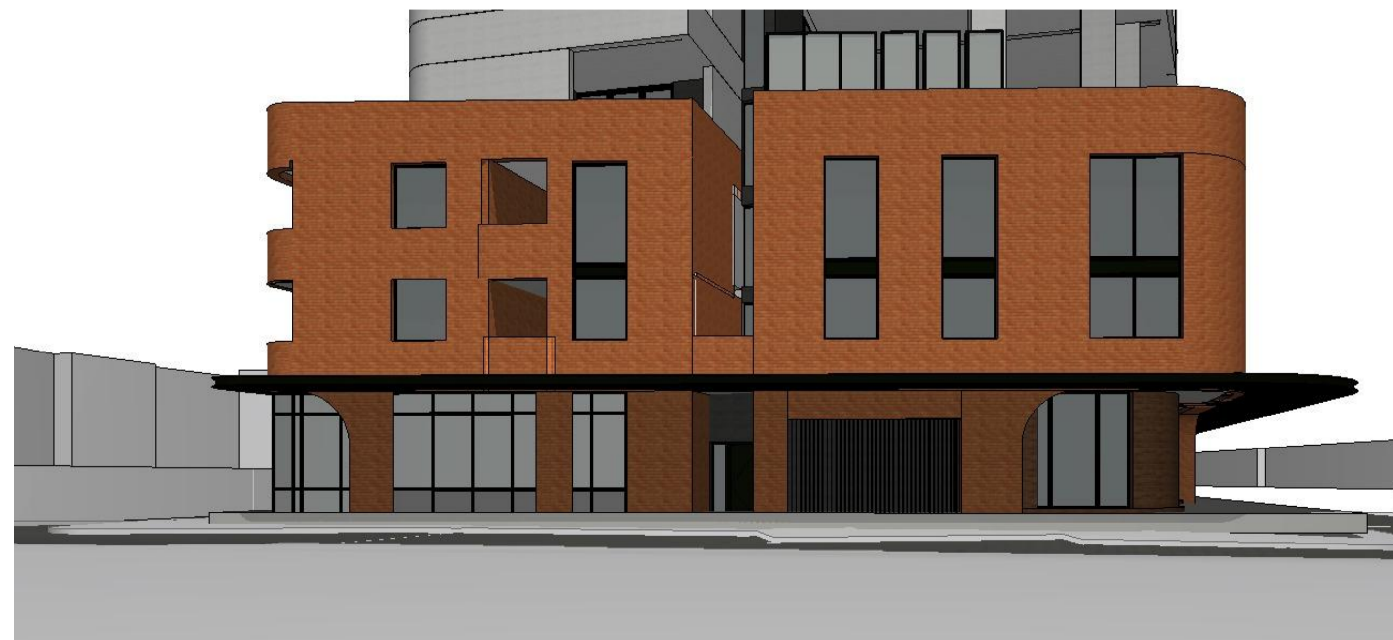
Marian Street Active Edge