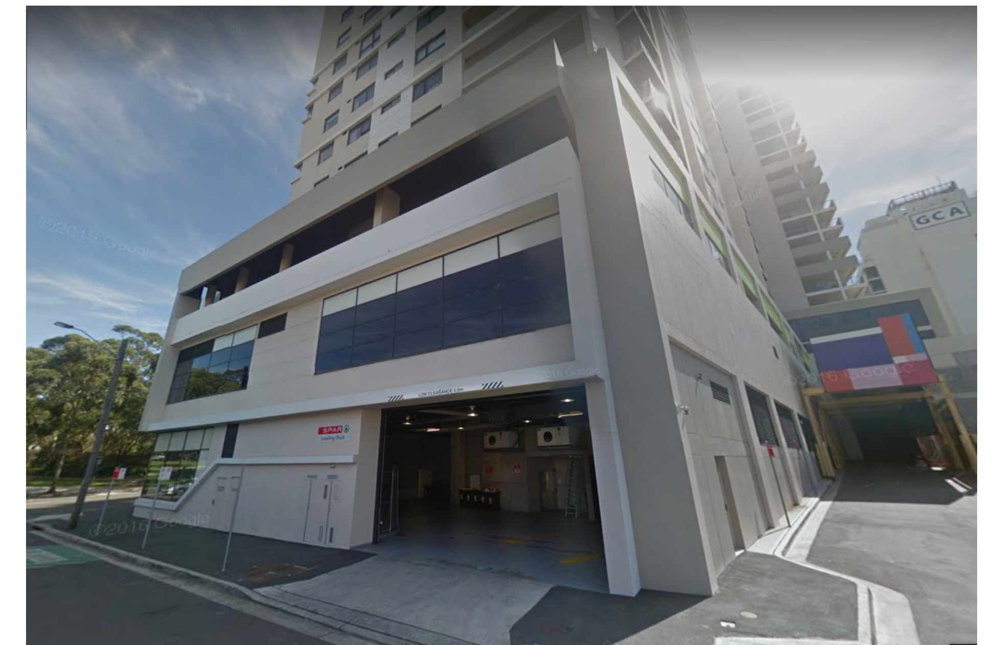
6-9 Redfern Street Building Marian Street Facade