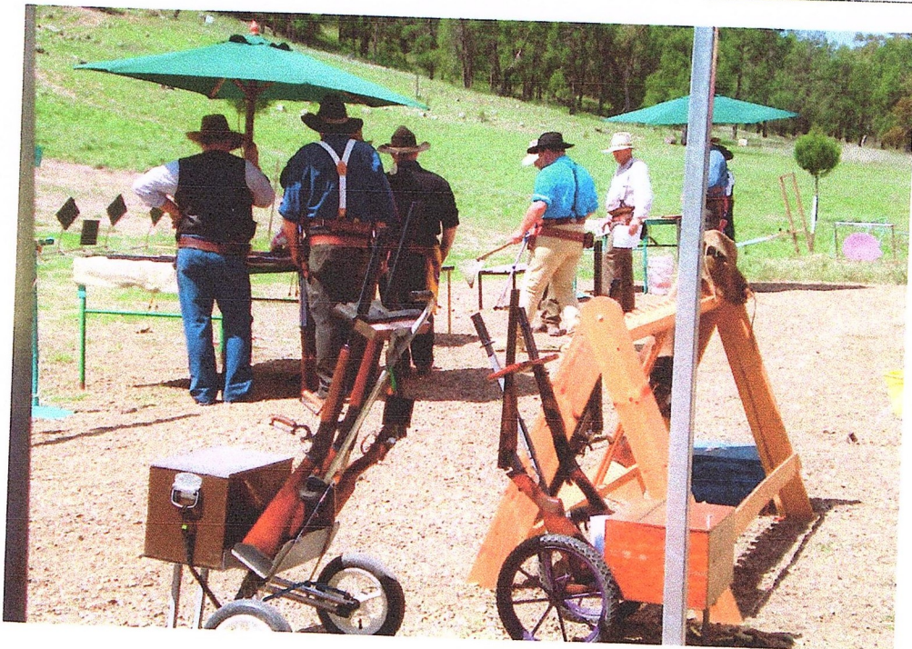
Club members enjoying a shoot