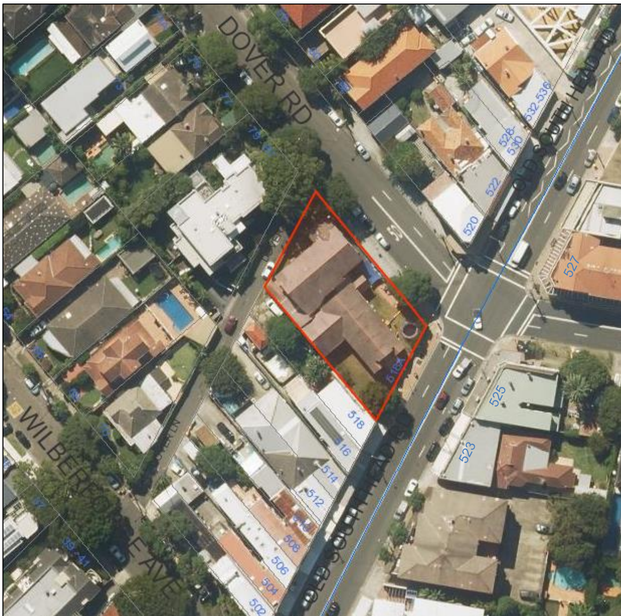
Figure 3: Aerial photograph showing the subject site outlined in red