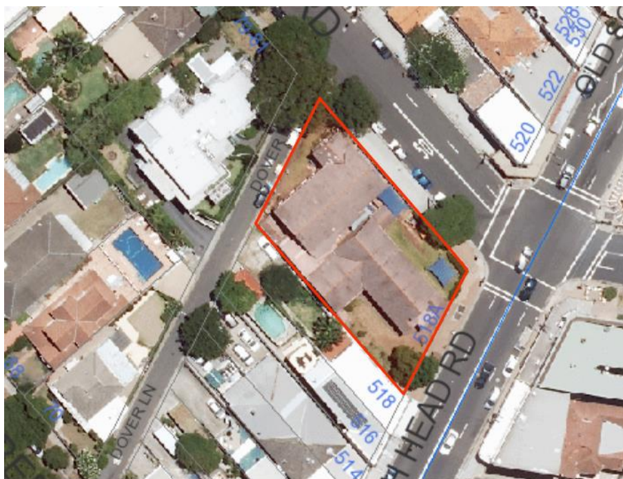
Figure 3: Aerial photograph showing the subject site outlined in red .

Church buildings occupy the majority of the site, with two small areas of lawn and landscaping on either side of the church building and a play area at the rear adjacent to the Hall (see the aerial image of the subject site in Figure 3). The complex is surrounded by a brick and roughcast fence fronting Old South Head Road and Dover Street, and a timber paling fence along Dover Lane and the South boundary. The subject site is not listed on the NSW State Heritage Register (SHR), nor is it included in Schedule 5: Environmental heritage of the Woollahra Local Environmental Plan 2014 (Woollahra LEP 2014). The site is not in the vicinity of a listed item.