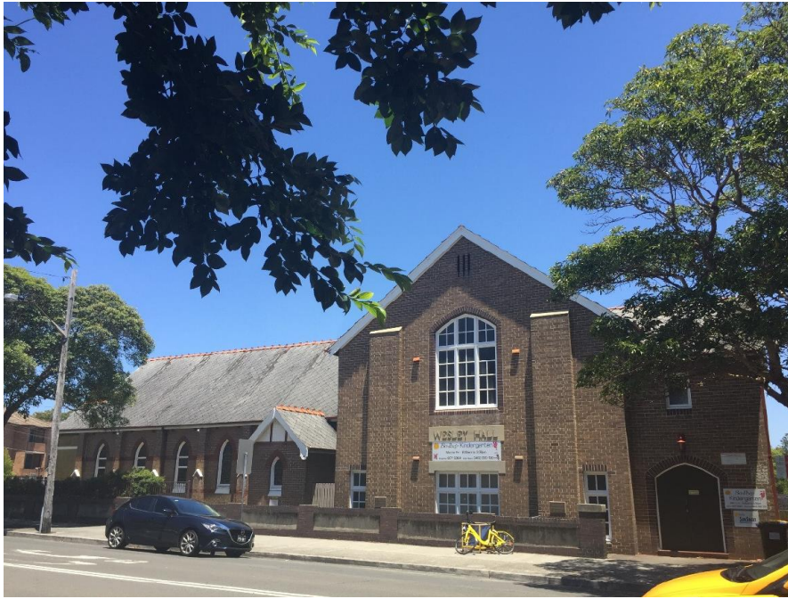
Figure 4: Wesley Hall and North elevation of Church from Dover Road