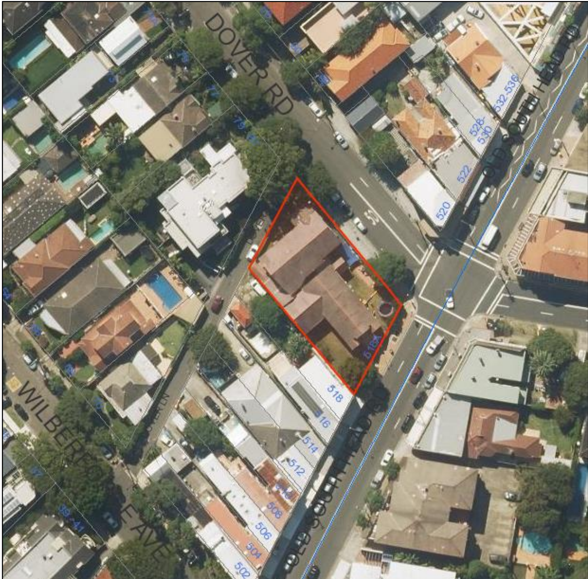
Figure 3: Aerial photograph showing the subject site outlined in red