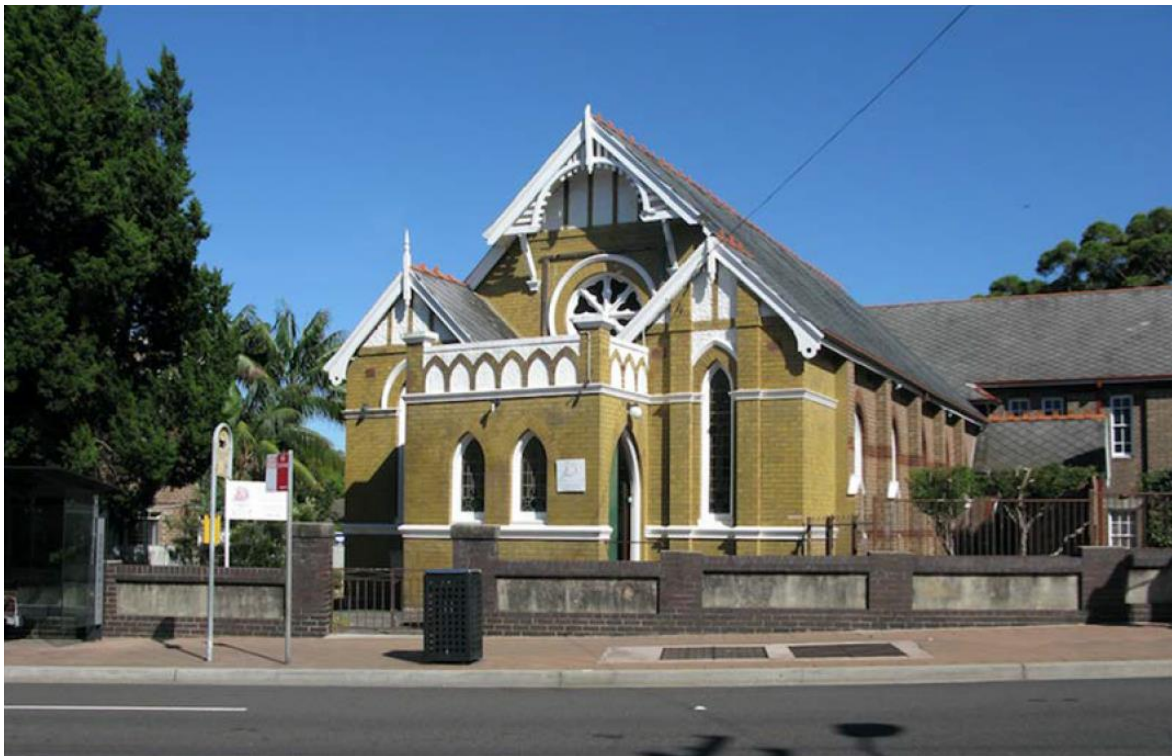
Figure 1: Rose Bay Methodist Church (1904) and the Wesley Hall (1929), (Source: RA Moore February 2018).

Rose Bay Uniting Church and Wesley Hall Group – church and interiors (including moveable heritage, vestry and 1924 additions), Wesley Hall and interiors.