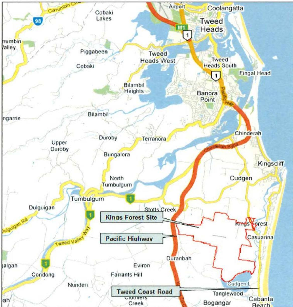
Figure 1 – Regional Context of Kings Forest