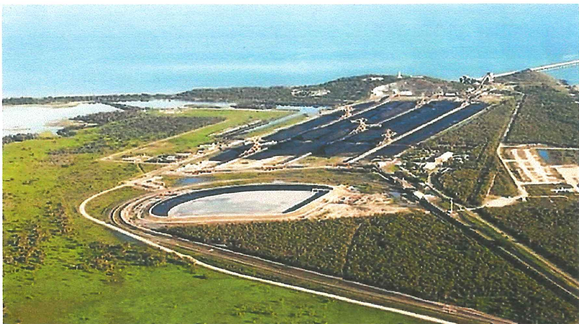
Adani's proposed Carmichael coal mine would be so huge it would lower the world price of coal.

Normally I'd be happy to defend an industry against the idea that it didn't contribute much because its capital intensity meant it directly employed few workers.