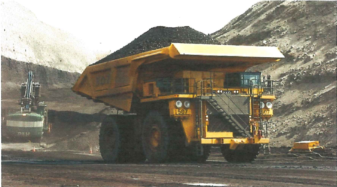
The dramatic coal price rally of 2016 was not enough to bring Yancoal into profitability.

This is always a good way to impress judges - who know a lot about law, but little about economics - when you're trying to persuade them to let you despoil the environment.