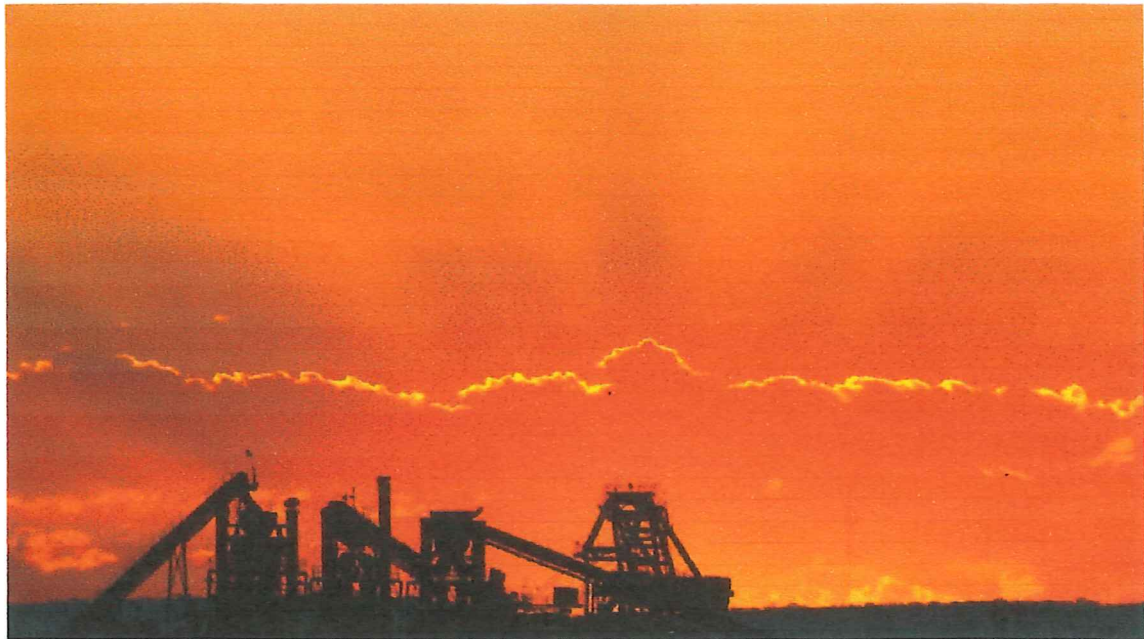
Capital expenditure is a dirty word in the commodities sector. MAX MASON-HUBERS

workforce it employs, it's even less: 2 per cent.