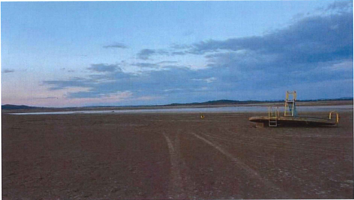
This is the pontoon to swim out to, which normally would be a quarter of kilometre from shore