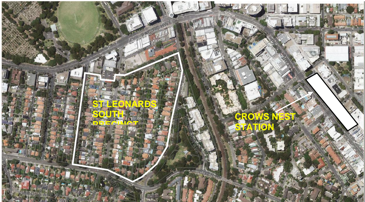
Figure 2: Sydney Metro Rapid Transit station proposed at Crows Nest – proximity of St Leonards South precinct

Notwithstanding, the precinct has an existing train station which runs frequently and carries large numbers of passengers.