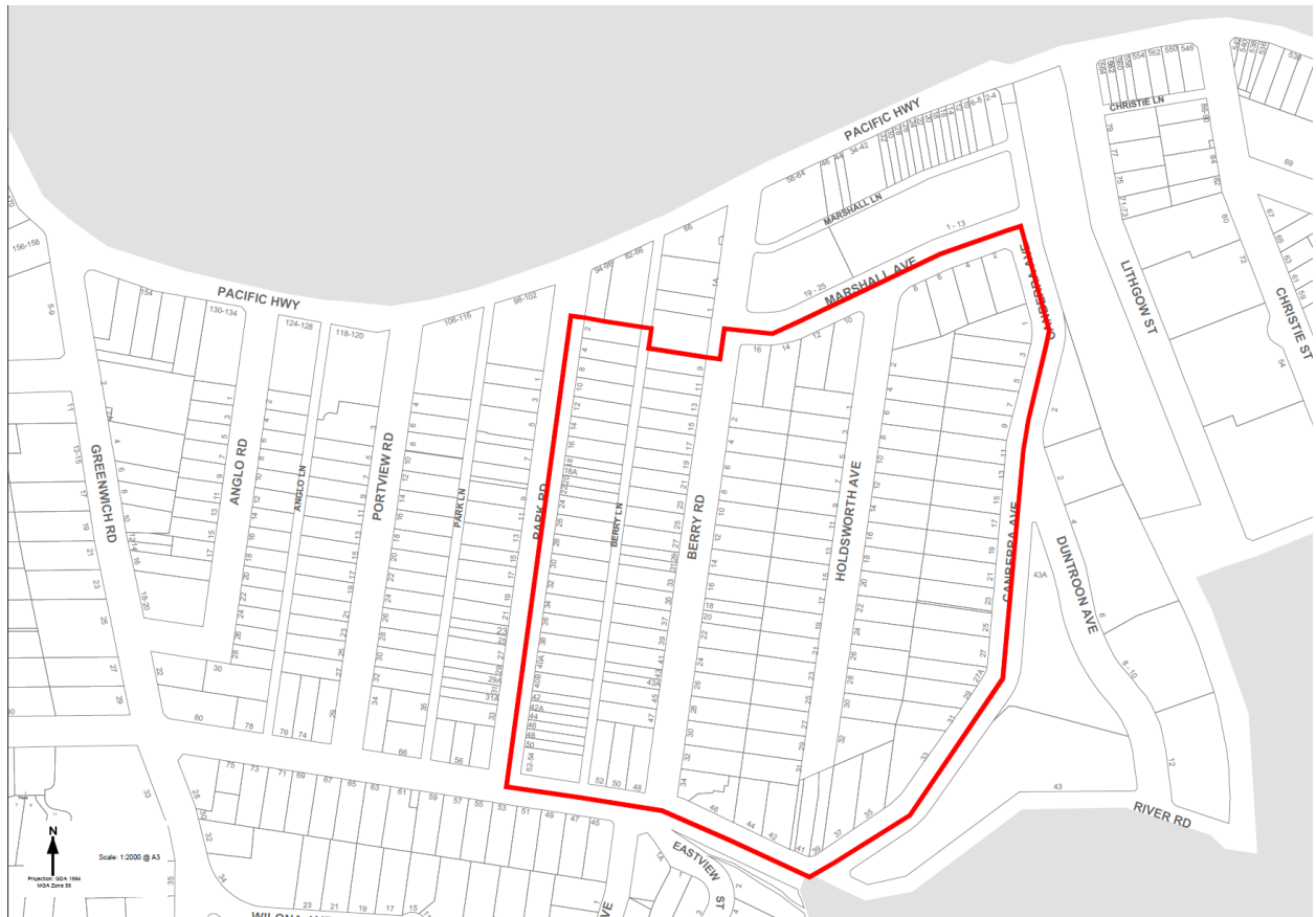
Figure 1: St Leonards South rezoning area

The following amendments are supported by Council Resolution 123 ( AT-B ) from the Extraordinary Council Meeting of 13 July 2015. The purpose of these amendments is to facilitate the orderly redevelopment of a low density residential precinct for residential flat buildings, public parks, community facilities and public road.