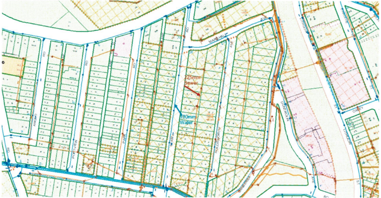
Figure 1: Hydra View of Assets Around Proposed Development Site