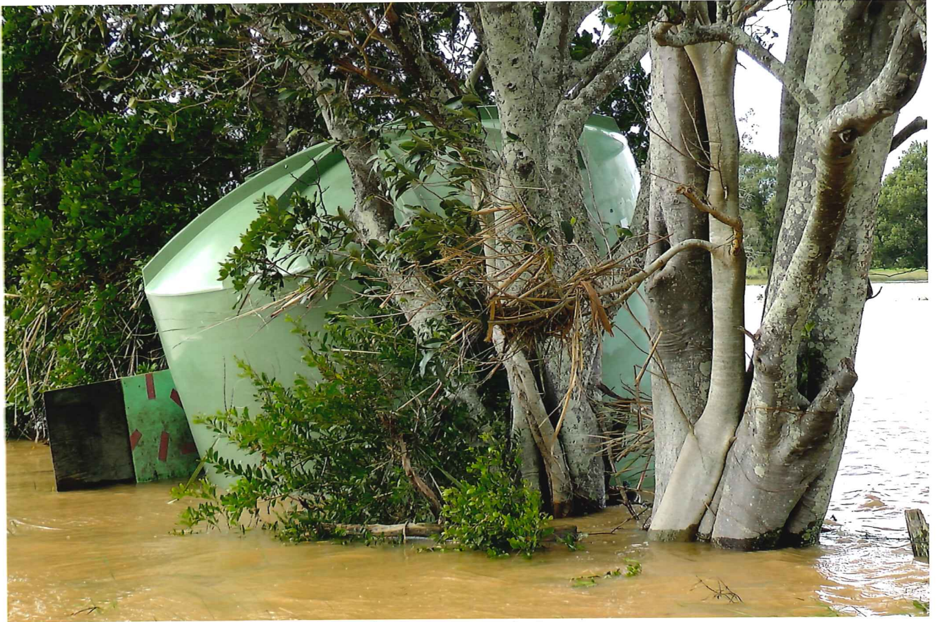
PARKLANDS WATERTANK ON WOONYUNG RD

THIS IS ONE OF PARKLAND'S WATER TANKS. IT WAS SWEEPED ONTO THE EDGE OF WOONYUNG RD AND GOT STUCK THERE.