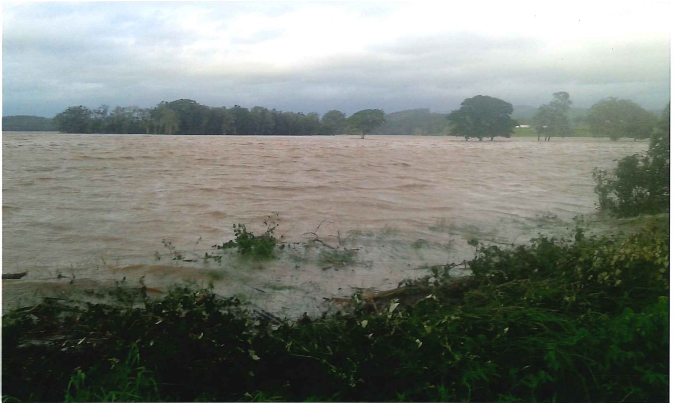
LOOKING SOUTH ONTO PARIELLANDS FROM WOOLONG RD