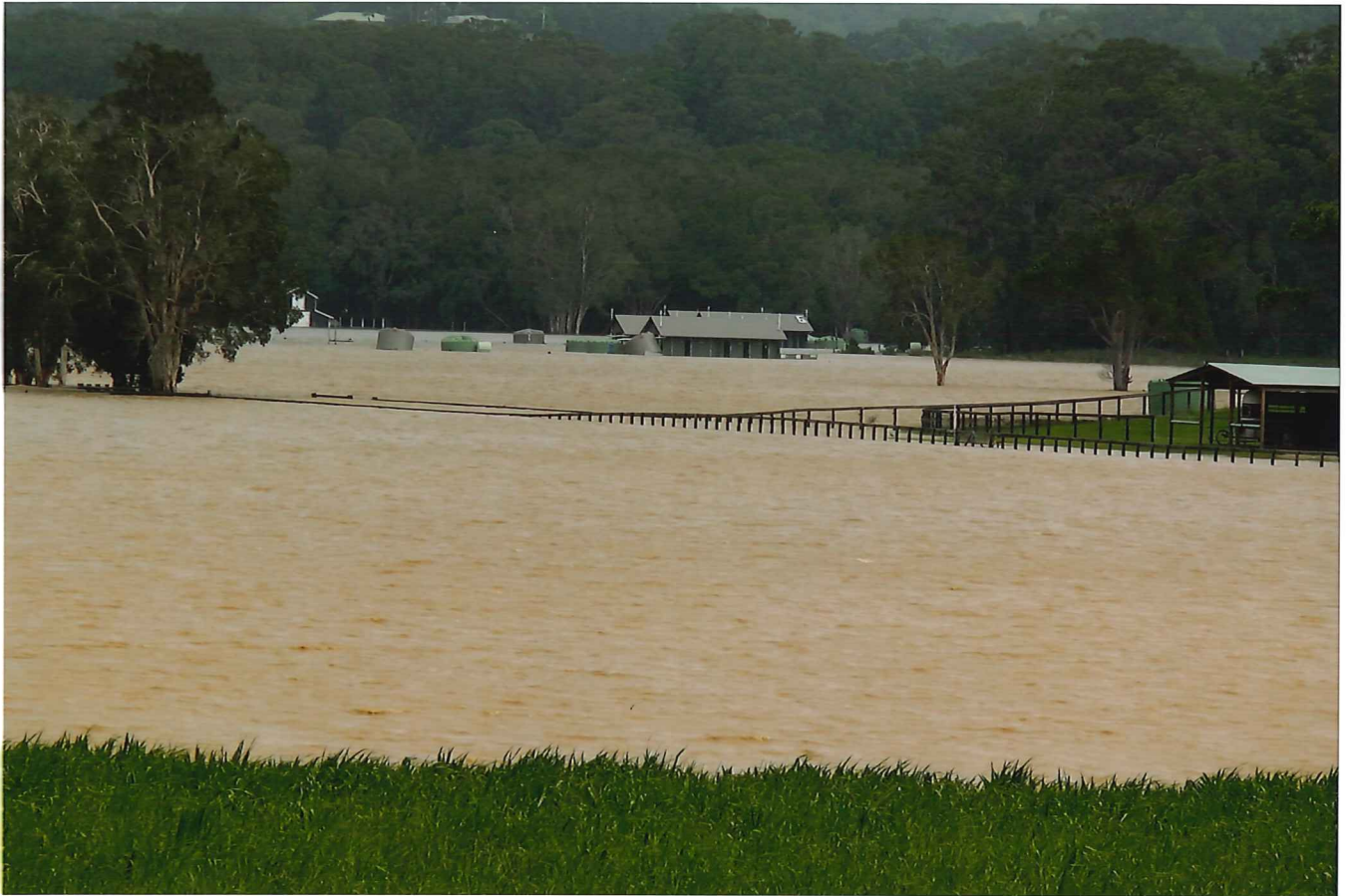
WOOLUNGRIE LOOKING SOUTH

THIS PIC SHOWS HOW DEEP THE WATER IS ON THE NORTH PARLANDS SITE. NOTICE FENCE, WATERTANKS AND BUILDING (TOILETS?) THIS IS THE SITE WHERE UP TO 50,000 PEOPLE ARE CAMPING!