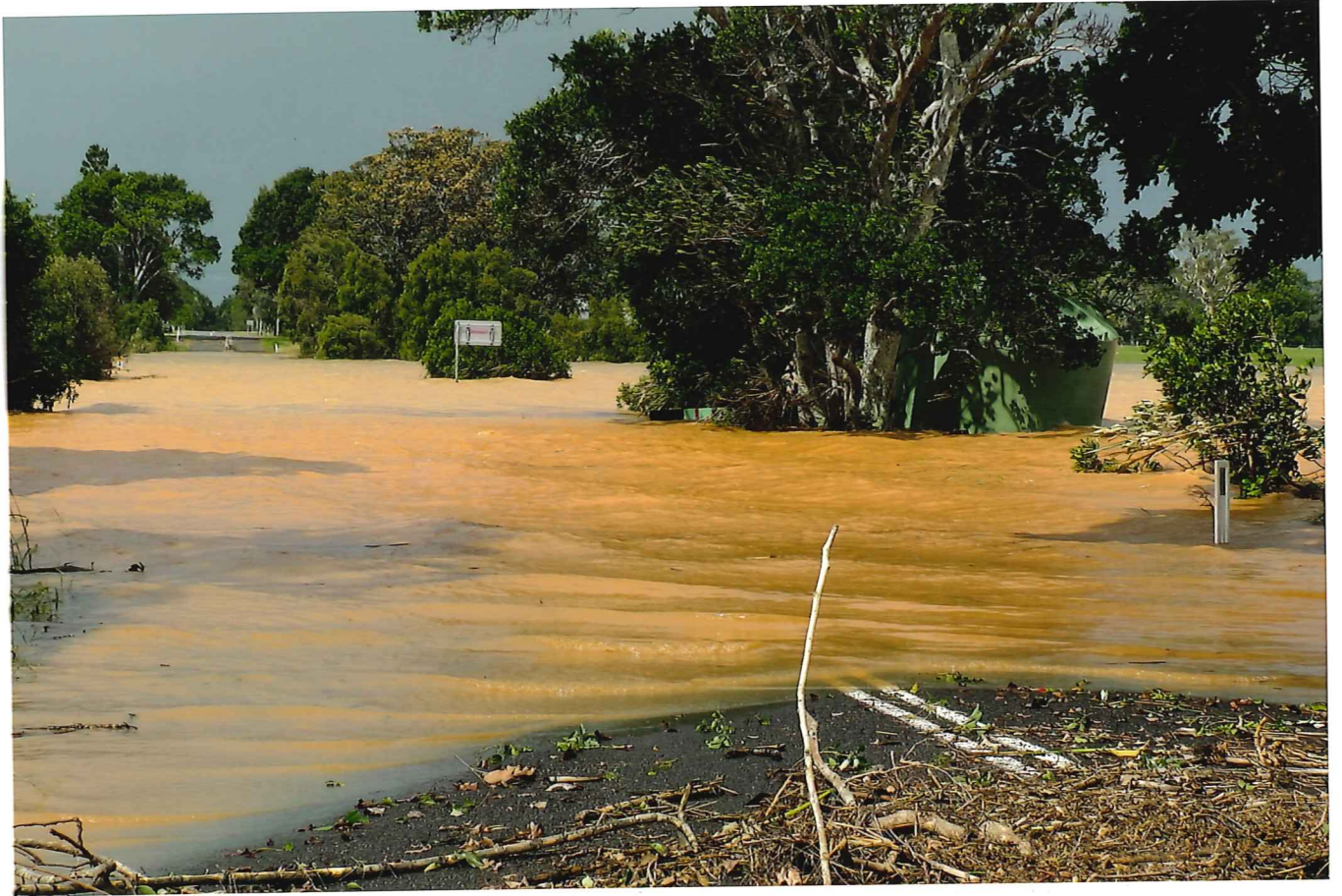
WOORYUNG RD LOOKING EAST

IN CASE OF AN EMERGENCY FLOOD EVACUATION NO ONE COULD TRAVEL EAST, TOWARDS POTSVILLE FOR DAYS. ALL TRAFFIC WOULD HAVE TO TURN WEST AND NAVIGATE THE WOOLLEN ONE-LANE BRIDGE TO THE HINTERLAND WAY. IMAGINE THE TRAFFIC JAM!