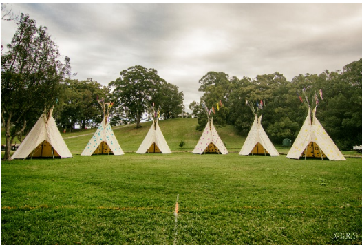
Splendour In the Grass Teepee village precinct.

A concurrent Section 75W Modification request has also been lodged to amend the terms of the existing Concept Approval to reflect the types of permanent cultural events that would be held at the site.