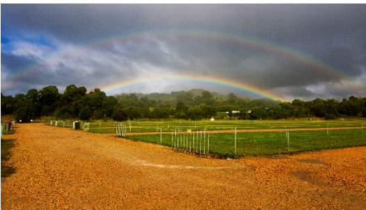
View of the car parking area in the south western part of the site looking south.