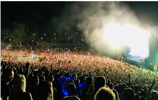
View from the south west of the amphitheatre looking towards the main stage.