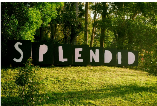
Example of site signage used during an event and removed after each event.