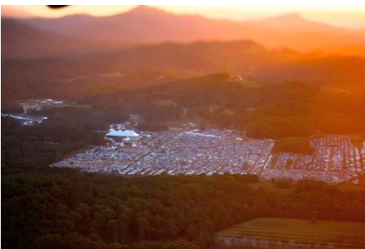
Night time view of the festival event area looking west.

As a permanent site for arts and culture, social benefits for the community generated by the project include: