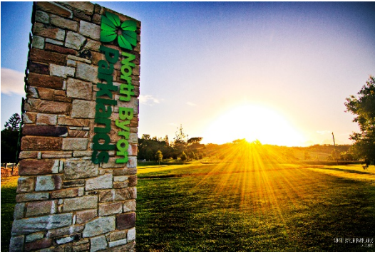
Permanent site signage.