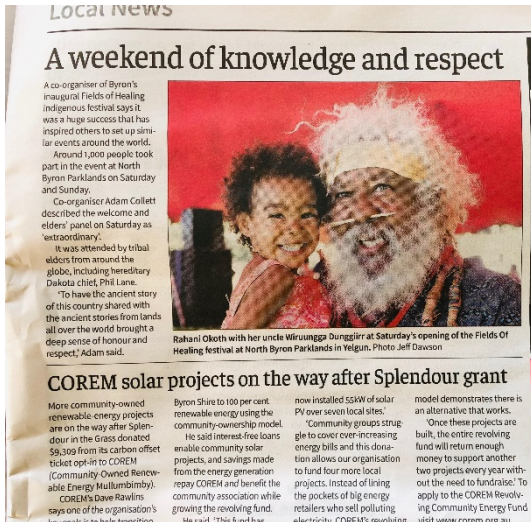
Press from the Fields of Healing indigenous festival recently held at North Byron Parklands