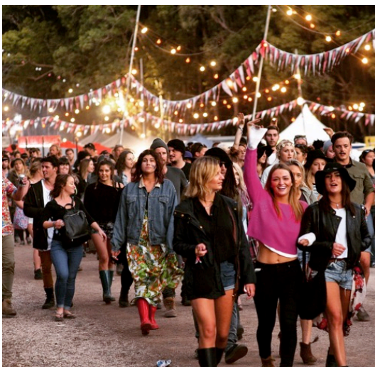
Falls Festival Byron patrons

Billinudgel Property Pty Ltd is the Applicant for a Development Application proposing the ongoing use of the North Byron Parklands (NBP) site for cultural events, and the construction and operation of additional infrastructure to support these events. The NBP site is located on the NSW Northern Rivers Region, approximately 22 kilometres (km) north of Byron Bay and 35 km south of Tweed Heads.