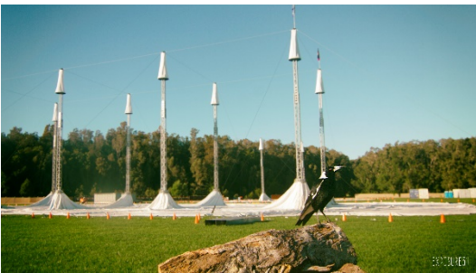
Splendour In The Grass "mix up tent" in the course of erection.

The proponent is generally supportive of the draft conditions of development consent crafted by the Department of Planning & Environment. We like the format of the conditions as proposed and generally believe that the conditions are fair and reasonable. However, there are two conditions we will make submissions to the IPC seeking amendment. Those conditions are: