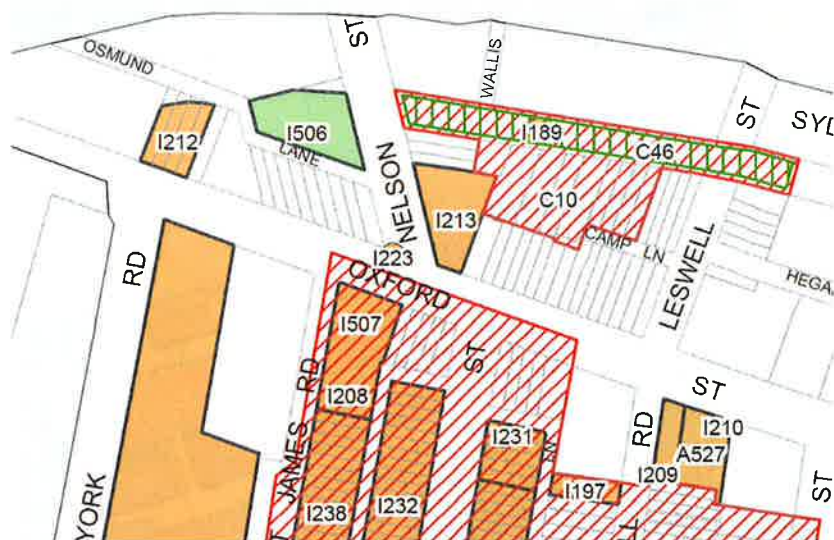
Figure 6: Extract from Waverley LEP 2012 Heritage Map showing heritage item 1212, and landscape item 1506 on the site