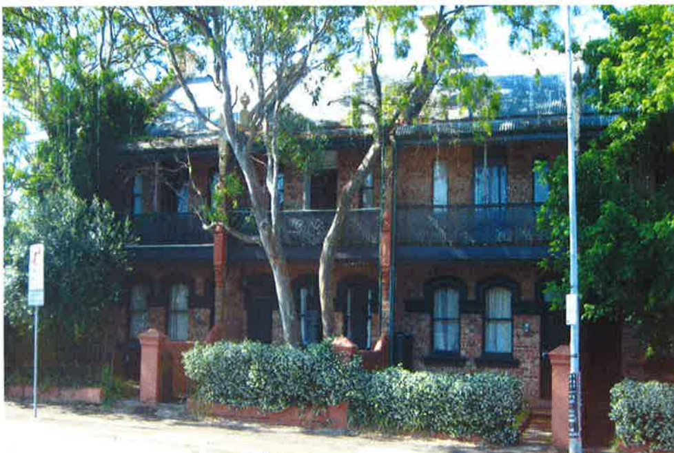
Figure 10: Row of four terrace houses at 194-200 Oxford Street.

Site 2 is adjacent to two heritage listed items on Nelson Street: The Nelson Hotel, and a Norfolk Pine tree. Council's officer report proposes a more sympathetic scale for the proposed Site 2 tower to respond to these items. Council staff recommended to Council that the maximum building height for Site 2 be reduced to the height of the existing heritage listed Norfolk Island Pine. The submitted survey shows the tree's height at 25m, as illustrated in Figure 11.