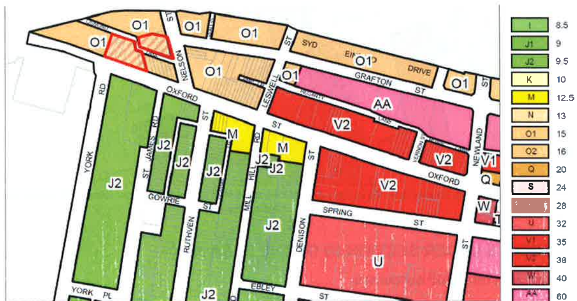
Figure 4: Extract from Waverley LEP 2012 Height Map