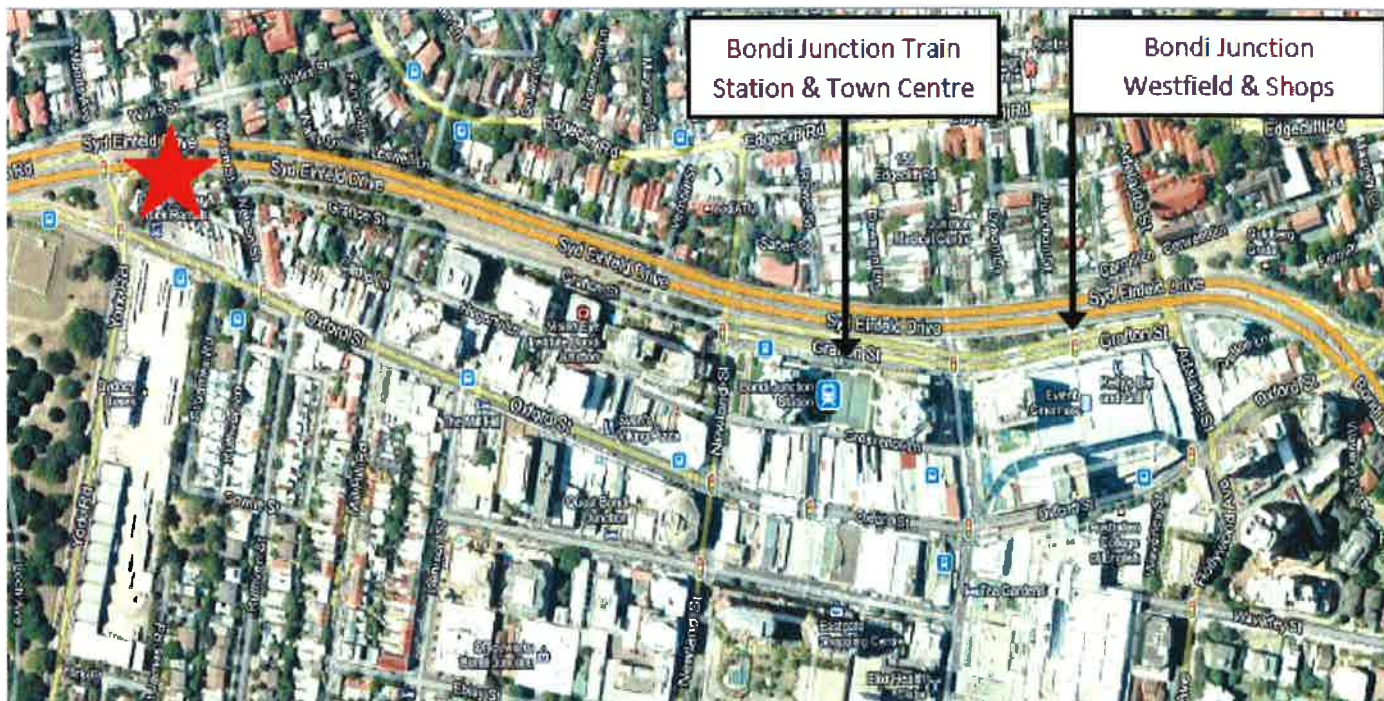
Figure 2: Site location.

A public plaza and thoroughfares are also proposed. The planning proposal does not seek to change the B4 Mixed Use zone.