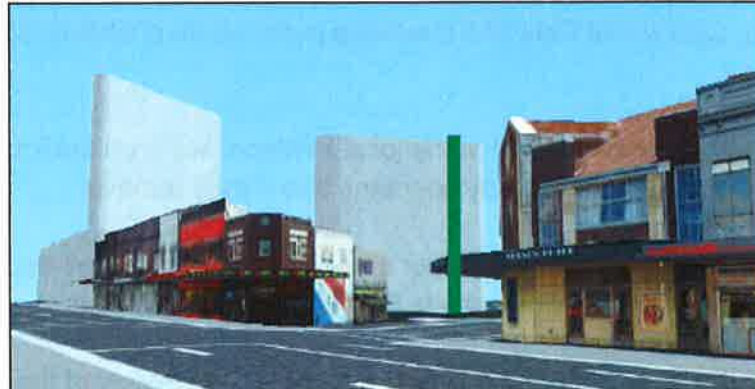
Figure 11: The green line represents the 25m high heritage listed Norfolk Pine. The proposed 11 storey tower with 36m height limit (now 38m) is at the top, and an 8 storey 25m tower is at the bottom.