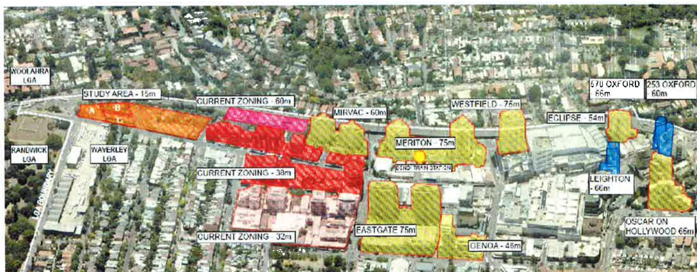
Figure 9: Extract from proponent's report demonstrating the existing and proposed tower forms in the area