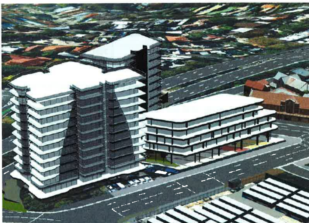
Figure 8: Conceptual image of future western entrance to Bondi Junction town centre: Proponent

Council's staff report sought a further reduction in building height from 25m for 'Site 2' and a reduction in floor space ratio from 3.5:1 to 2.4:1 for this site to align with the revised height. The aim of these reductions was to minimise amenity impacts on both the surrounding area and proposed on-site open space areas (see further discussion under heritage below).