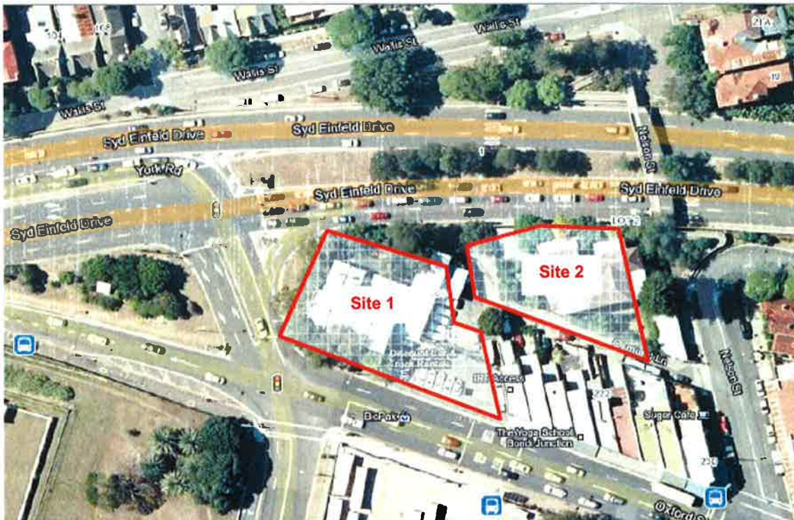
Figure 1: Site.

This planning proposal ( Tab D ) aims to enable the redevelopment of the sites which comprise the western end of the Bondi Junction centre. The subject site, 194-214 Oxford Street (Site 1) and 2 Nelson Street (Site 2), is bounded by Oxford Street, Syd Einfeld Drive, York Road and Nelson Street. The site is at the border of Woollahra and Randwick Councils, and diagonally opposite Centennial Park.