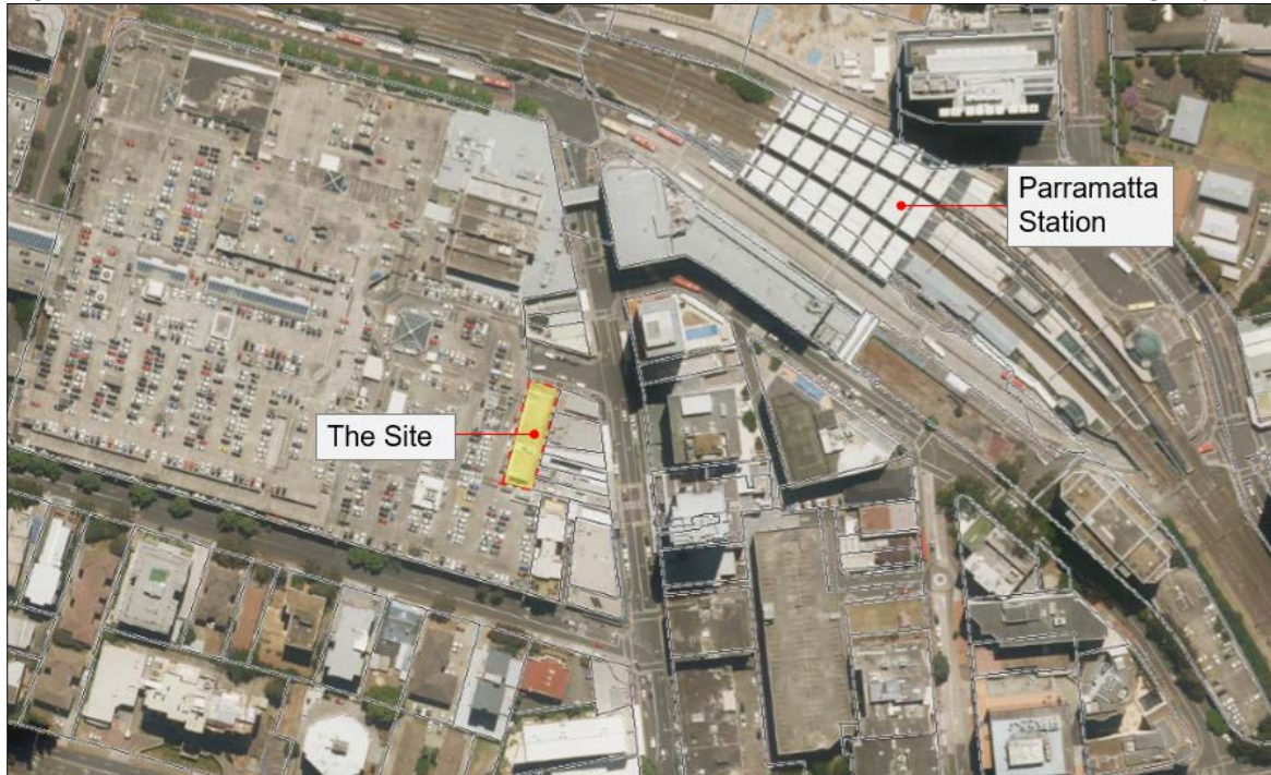
Figure 1: Site location – 55 Aird Street, Parramatta (Base source: Pacific Planning Pty Ltd)