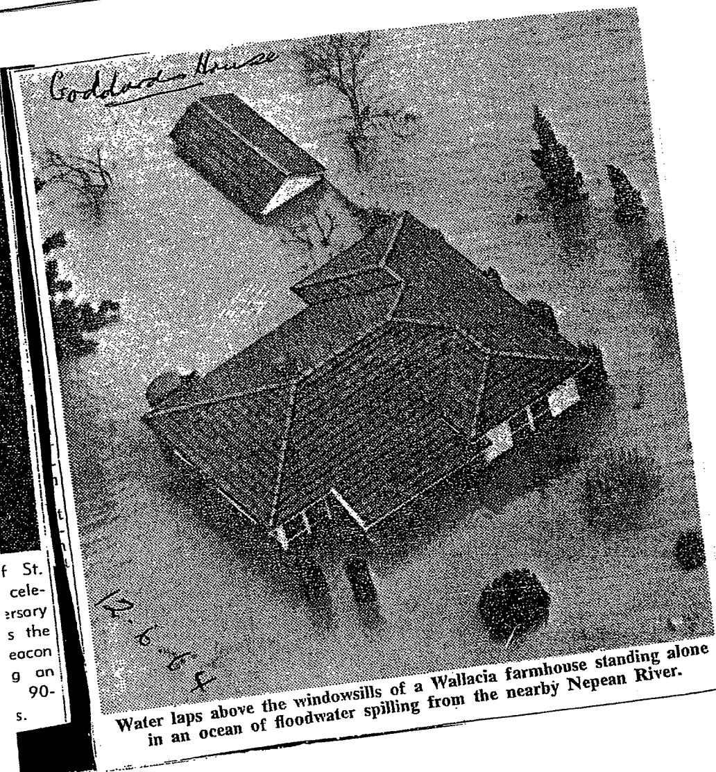
Water laps above the windowsills of a Wallacia farmhouse standing alone in an ocean of floodwater spilling from the nearby Nepean River.

f St. cele- rsary s the econ g an 90- s.