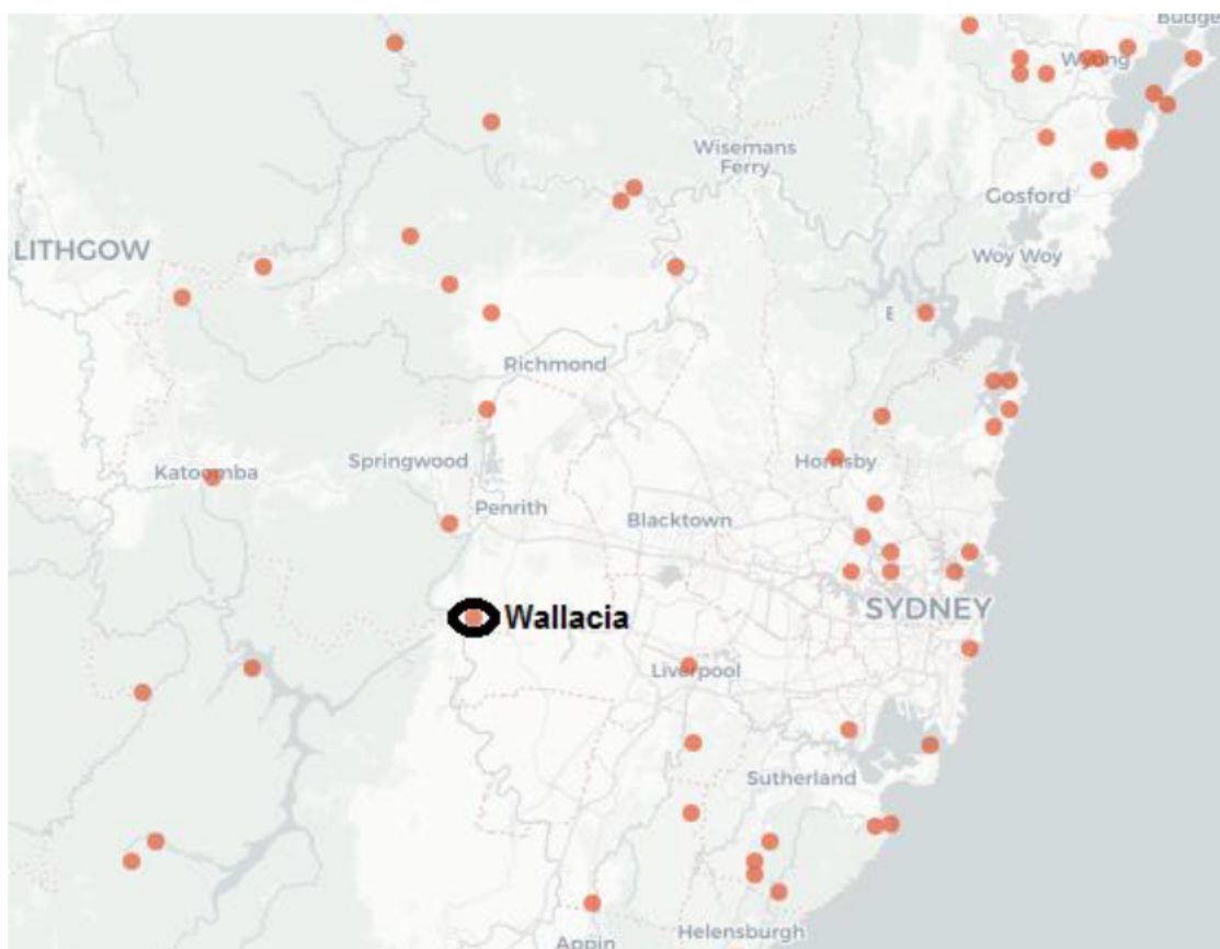
Figure 3 – Regional records of Pterostylis curta

It appears that records of P. curta are generally absent from the Cumberland Plain and associated Cumberland Plain Woodland, tending to occur on the fringes in areas where sandstone geology occurs. The site is located over shale geology and on the edge of the Cumberland Plain. There is potential that the species could occur however it's not likely to be in an ideal substrate or location.