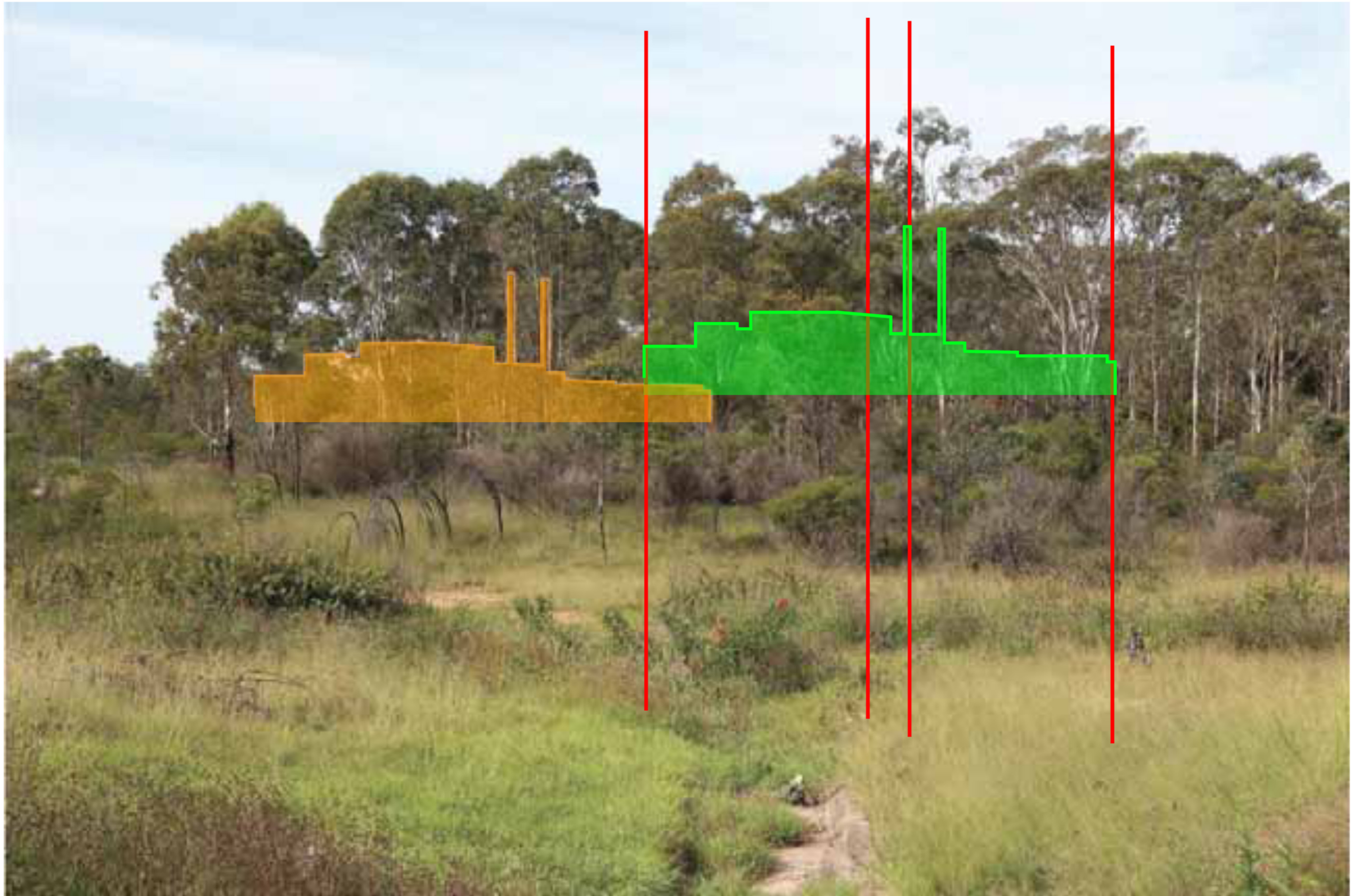
FIGURE 39 – PHOTOSIMULATION AND BUILDING OUTLINE VIEW EAST TOWARDS THE PROJECT – SENNA LANE

COPYRIGHT This drawing is the copyright of Urbaine Pty Ltd. It is issued on condition that it is not to be copied or reproduced in any form or disclosed to any unauthorised person, either wholly, or in part without the express written consent of Urbaine Pty Ltd. Do not scale from this drawing. This drawing is to be read in conjunction with all relevant architect's and engineer's drawings and specifications. Contractors must verify all dimensions / levels on site prior to construction and preparation of shop drawings.