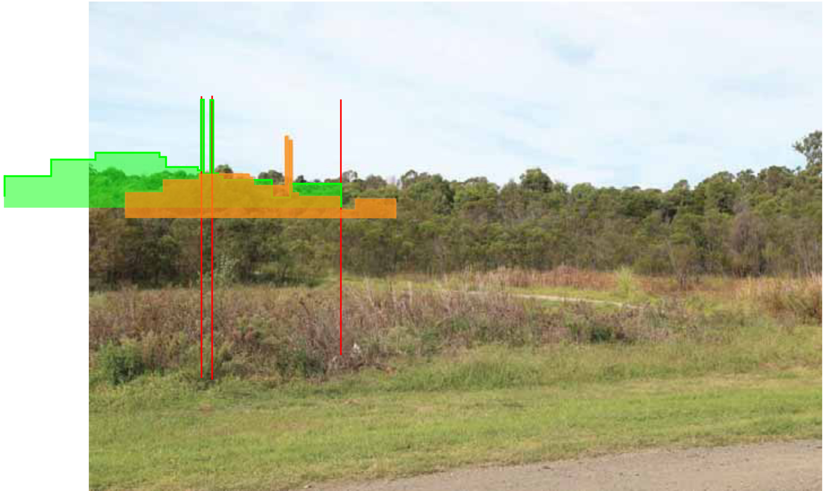
FIGURE 36 – PHOTOSIMULATION AND BUILDING OUTLINE VIEW EAST TOWARDS THE PROJECT – BLACKBIRD LANE

COPYRIGHT This drawing is the copyright of Urbaine Pty Ltd. It is issued on condition that it is not to be copied or reproduced in any form or disclosed to any unauthorised person, either wholly, or in part without the express written consent of Urbaine Pty Ltd. Do not scale from this drawing. This drawing is to be read in conjunction with all relevant architect's and engineer's drawings and specifications. Contractors must verify all dimensions / levels on site prior to construction and preparation of shop drawings.