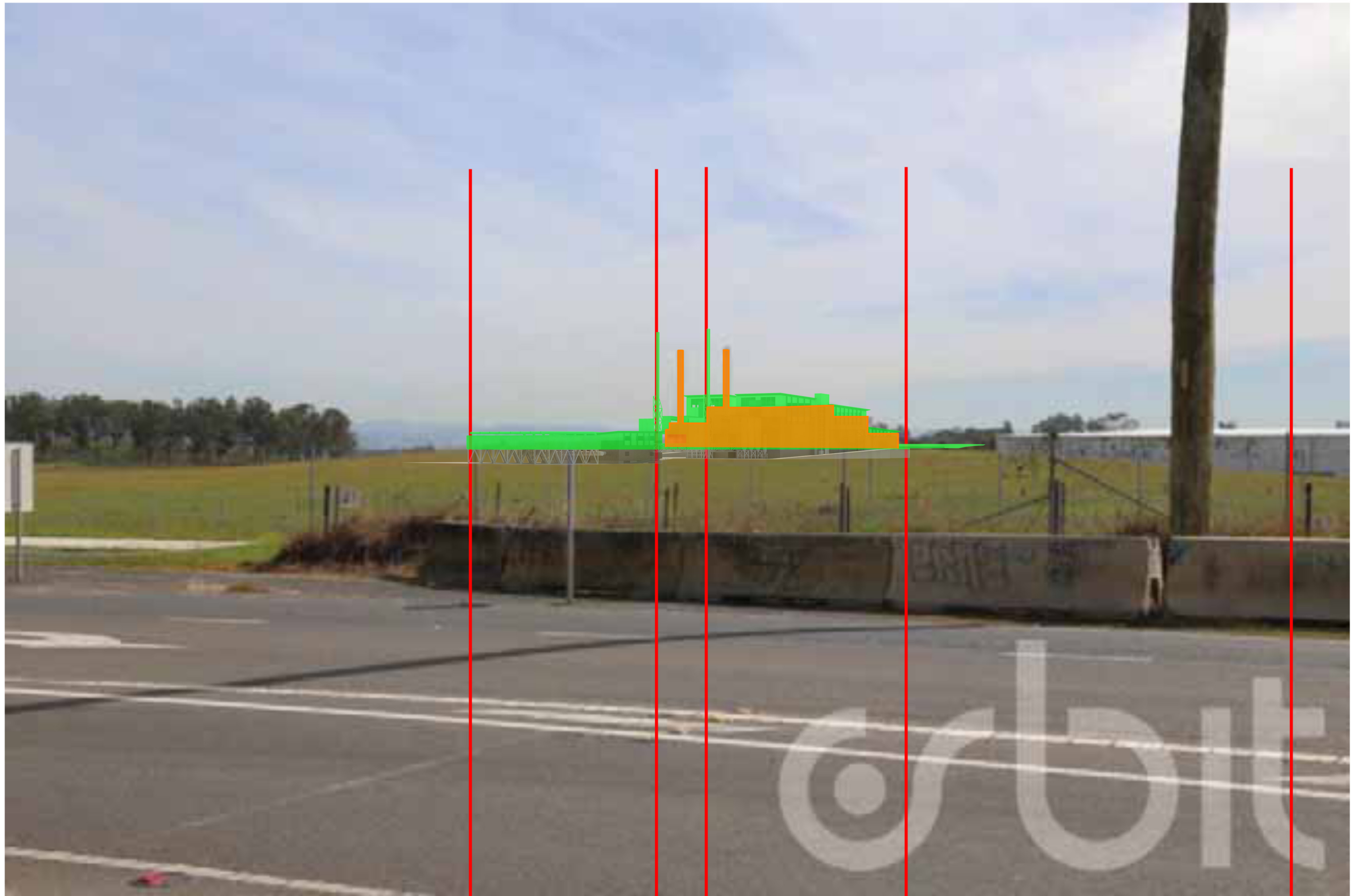
FIGURE 33 – PHOTOSIMULATION VIEW WEST TOWARDS THE PROJECT – OLD WALLGROVE ROAD

COPYRIGHT This drawing is the copyright of Urbaine Pty Ltd. It is issued on condition that it is not to be copied or reproduced in any form or disclosed to any unauthorised person, either wholly, or in part without the express written consent of Urbaine Pty Ltd. Do not scale from this drawing. This drawing is to be read in conjunction with all relevant architect's and engineer's drawings and specifications. Contractors must verify all dimensions / levels on site prior to construction and preparation of shop drawings.