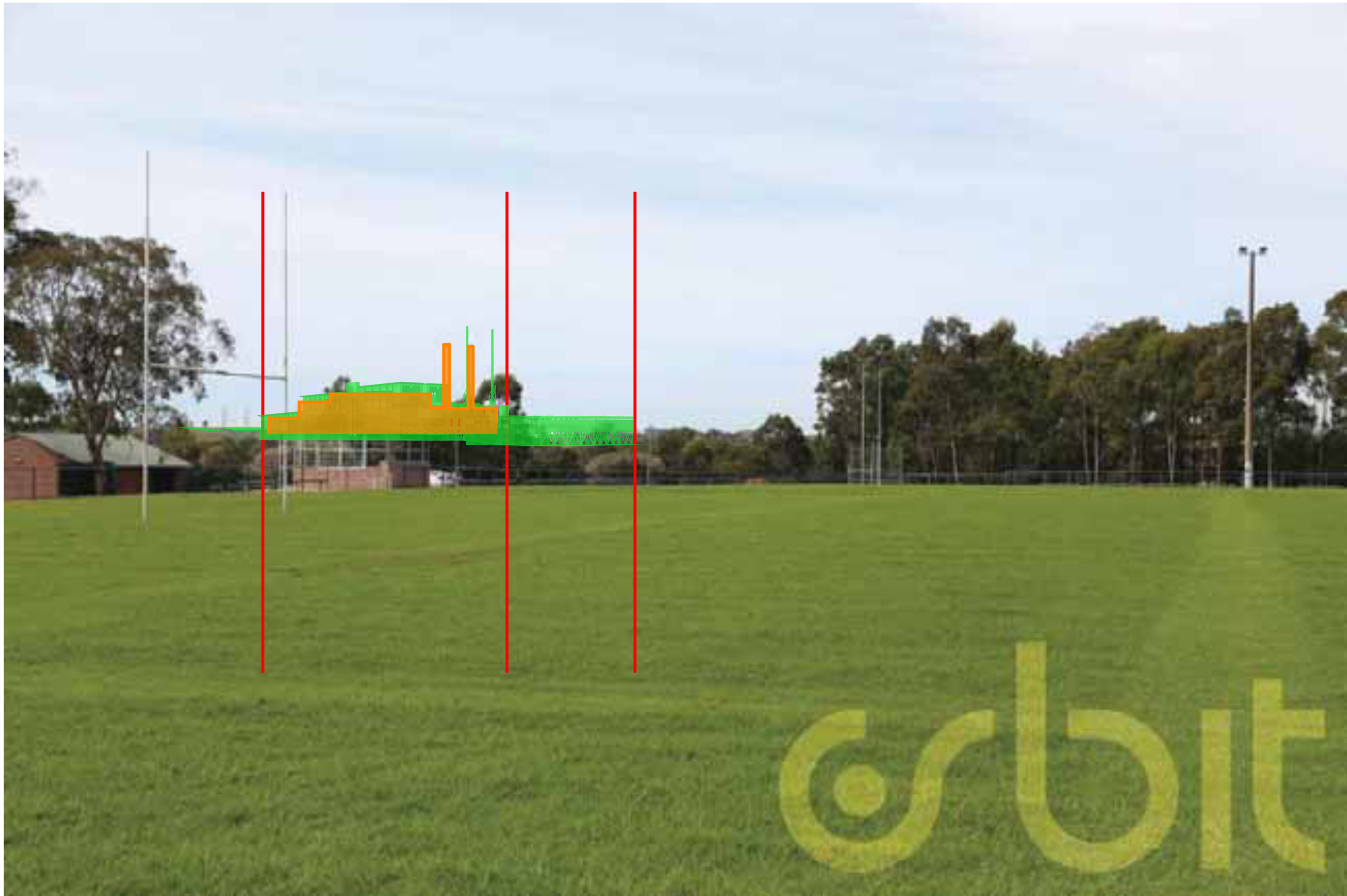
FIGURE 21 – PHOTOSIMULATION VIEW EAST TOWARDS THE PROJECT – PEPPERTREE PARK

COPYRIGHT This drawing is the copyright of Urbaine Pty Ltd. It is issued on condition that it is not to be copied or reproduced in any form or disclosed to any unauthorised person, either wholly, or in part without the express written consent of Urbaine Pty Ltd. Do not scale from this drawing. This drawing is to be read in conjunction with all relevant architect's and engineer's drawings and specifications. Contractors must verify all dimensions / levels on site prior to construction and preparation of shop drawings.