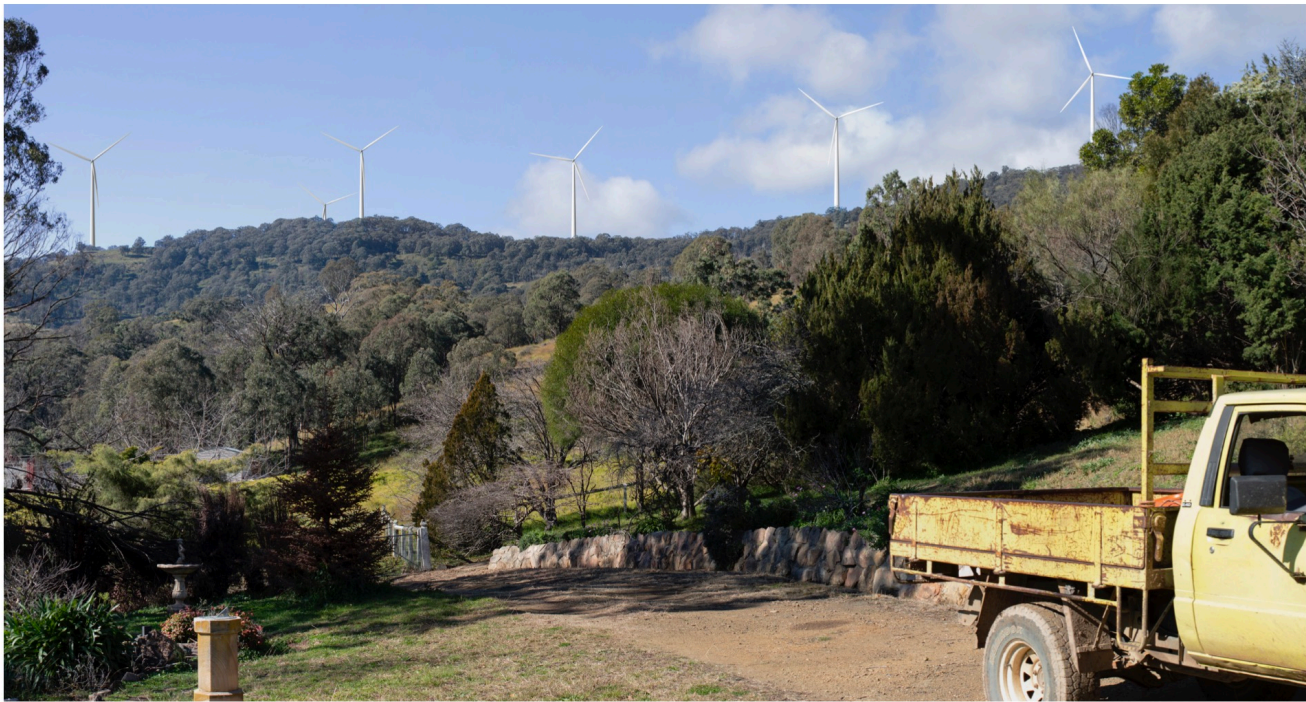
Proposed View - 60 degree Field of View

The tree on the right side of image in 30 YEARS OLD!! And it's still not blocking out turbine. If they plant more, trees will take long time to grow. Wind farm will be gone by then. The tree on the left side is now dead. It died in the drought! Trees on the ridge covering bottom parts of turbines belong to wind farm host and we have no confidence in their future.