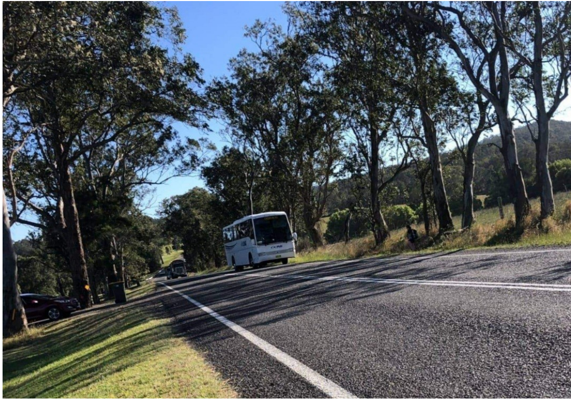
This is Dungog Road, before Gostwyck Bridge, on the right, student waiting to get on bus, bus cannot pull completely off road to pick student up, hazard lights are on.