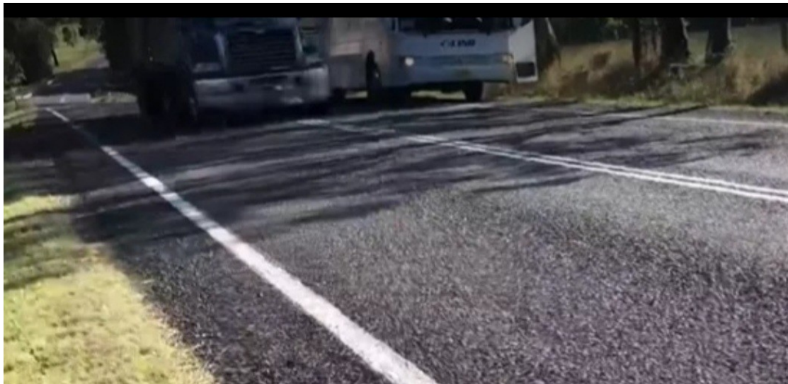
Dungog Rd, heading towards Gostwyck Bridge, student has just boarded bus, truck over takes bus on double lines, hazzards lights on.