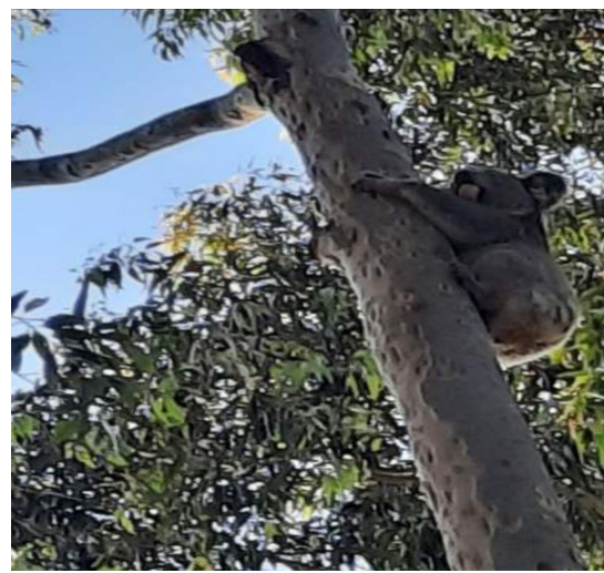
Pictures taken by residents that share boundaries with the quarry or live in close proximity.